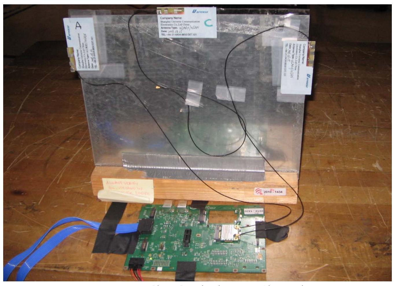
Radiated Emissions Configuration