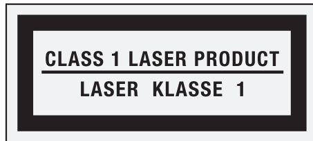
Example of the label

CLASS 1 LASER PRODUCT LASER KLASSE 1 LUOKAN 1 LASERLAITE APPAREIL A LASER DE CLASSE 1 KLASS 1 LASER APPARAT