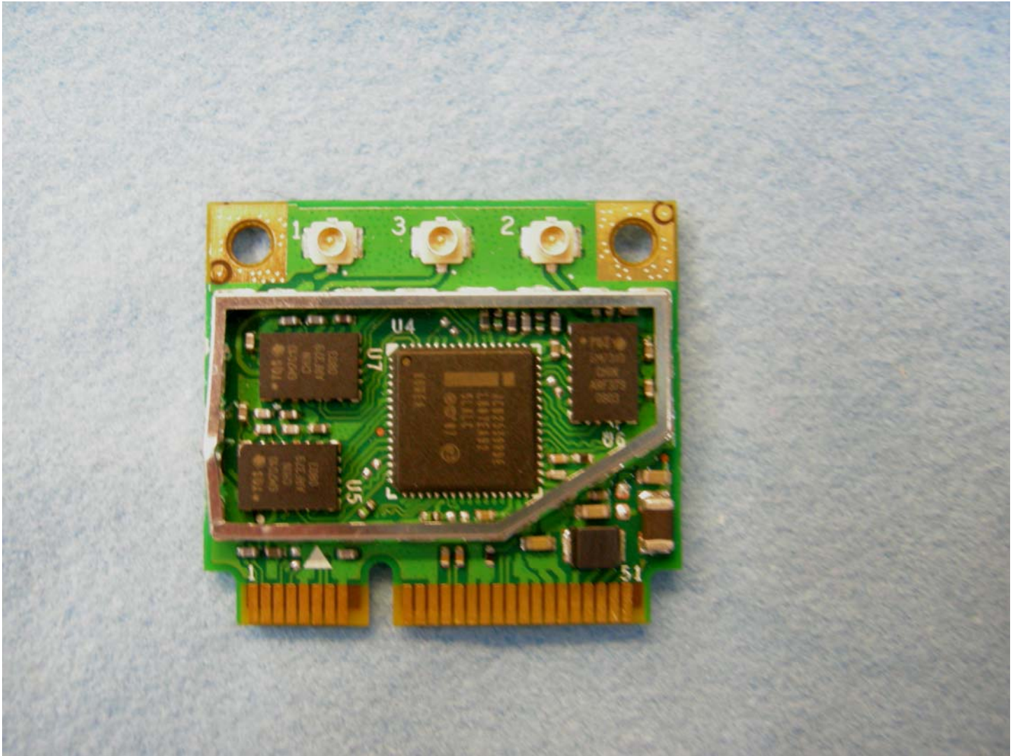
Top View “Inner Shielding removed”