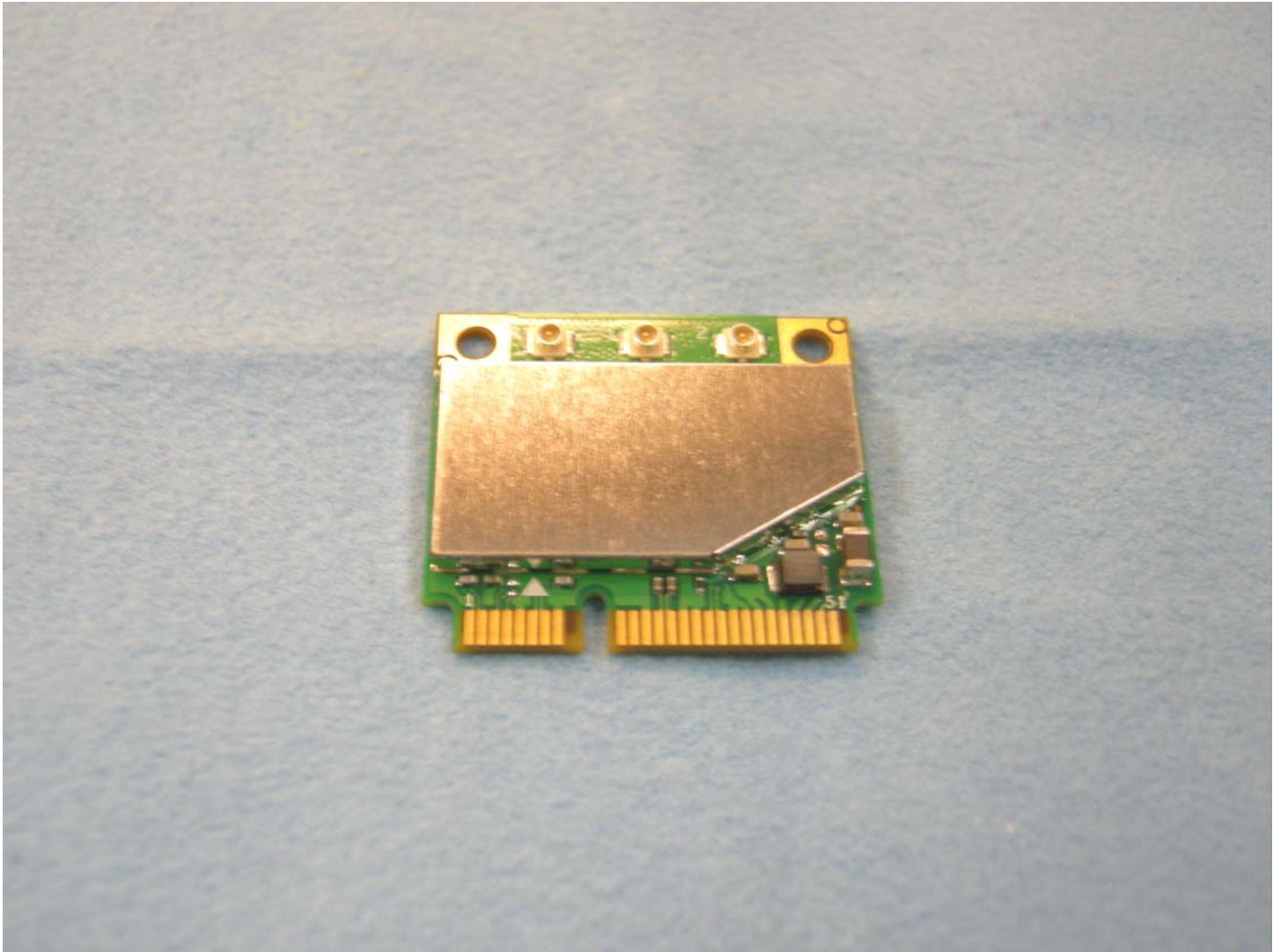
Top View “Insulation removed”