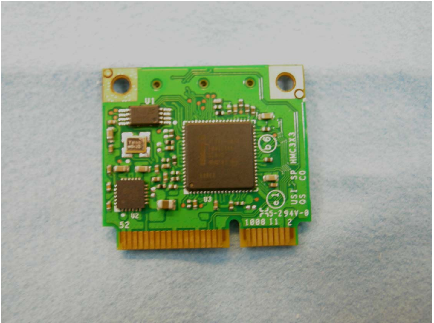
Bottom View “Insulation removed”