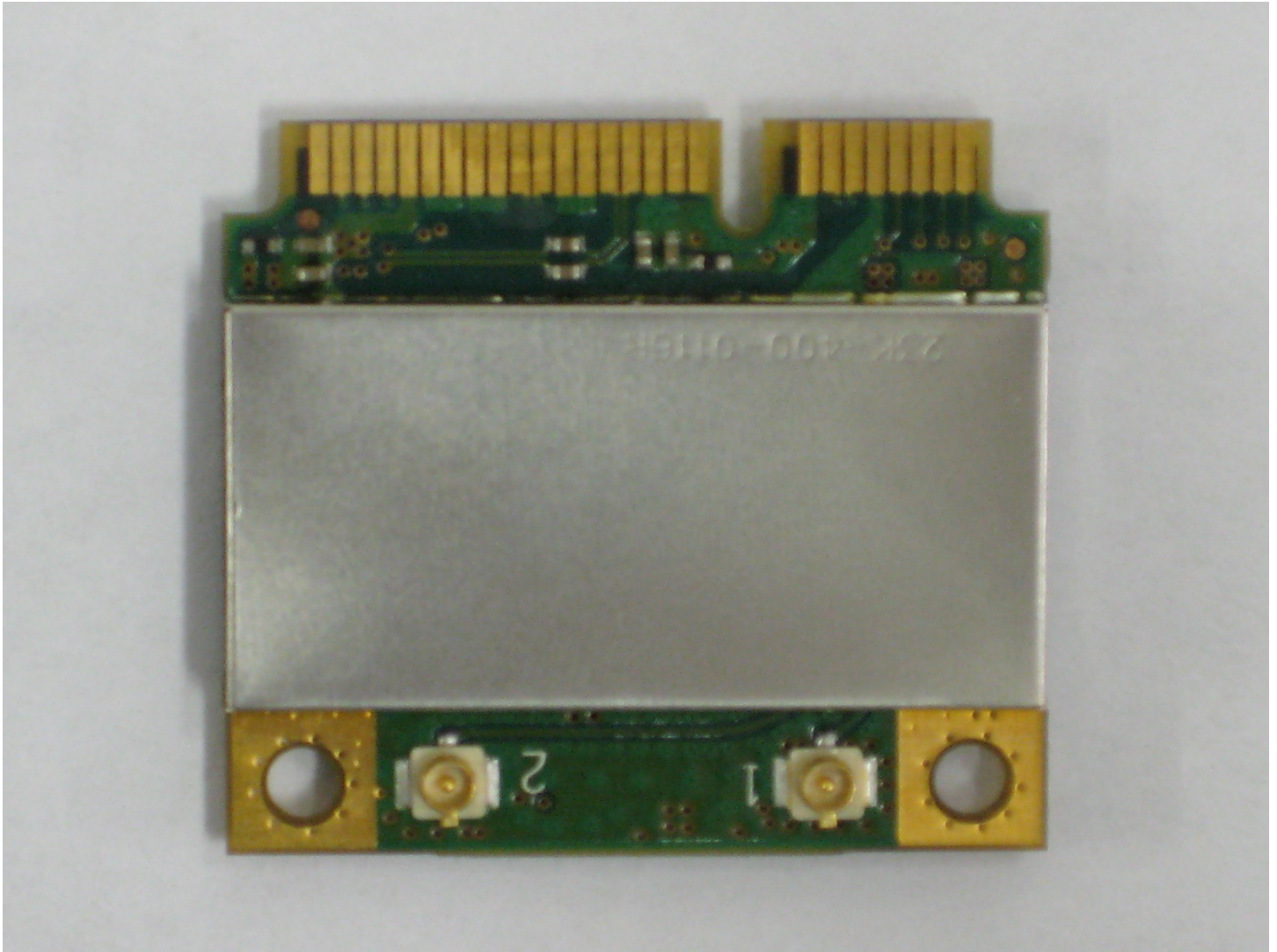
Top View “Insulation removed”