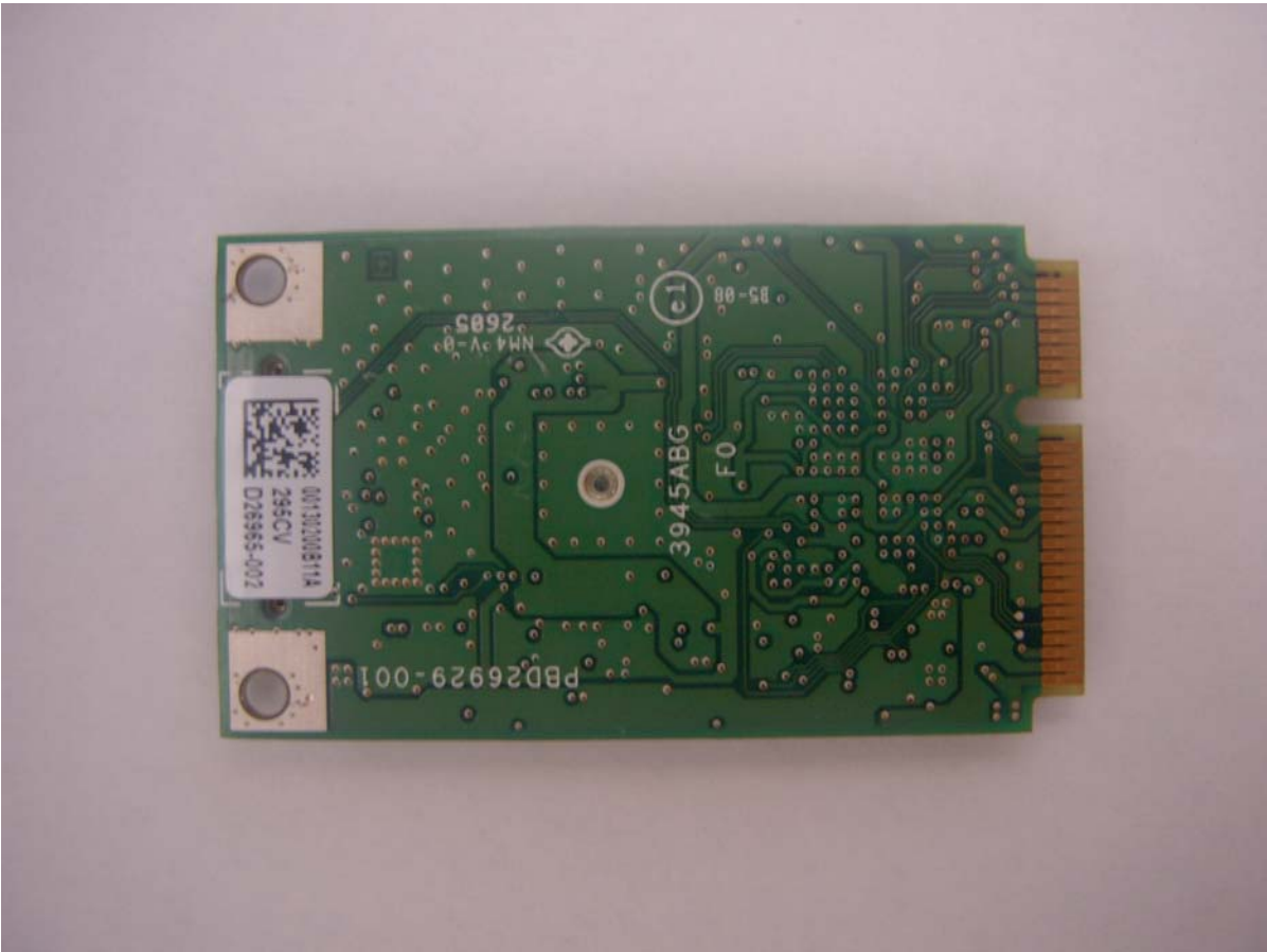
Bottom View “Insulation removed”