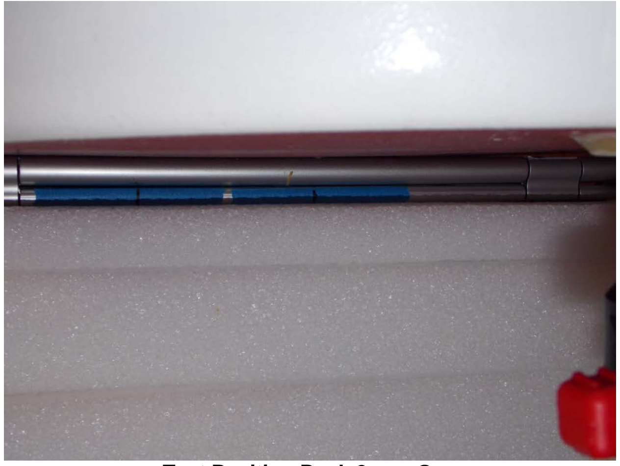
Test Position Back 0 mm Gap