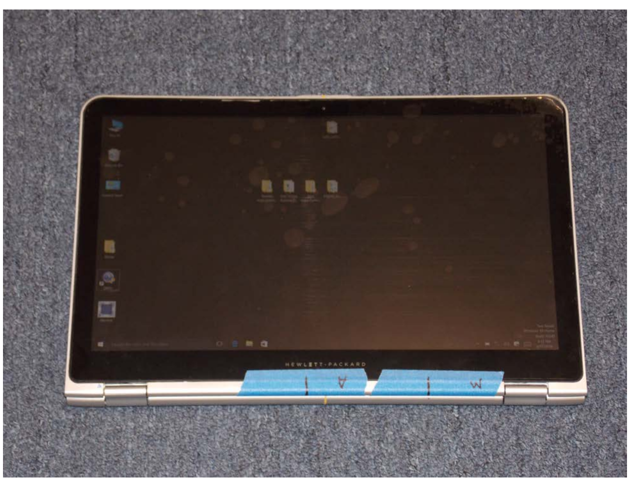
Front of Device Tablet Mode