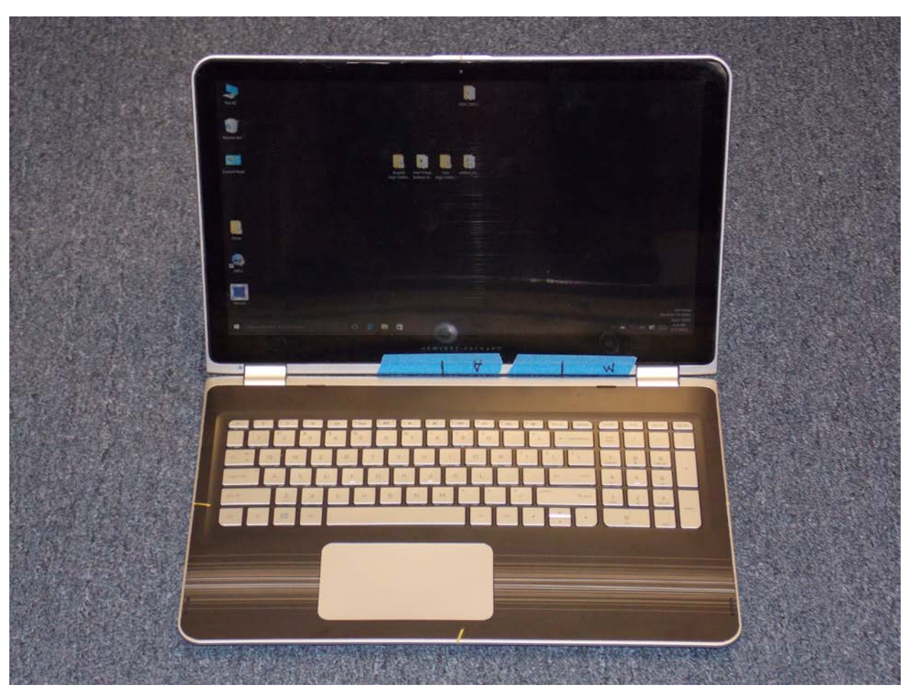
Front of Device Laptop Mode