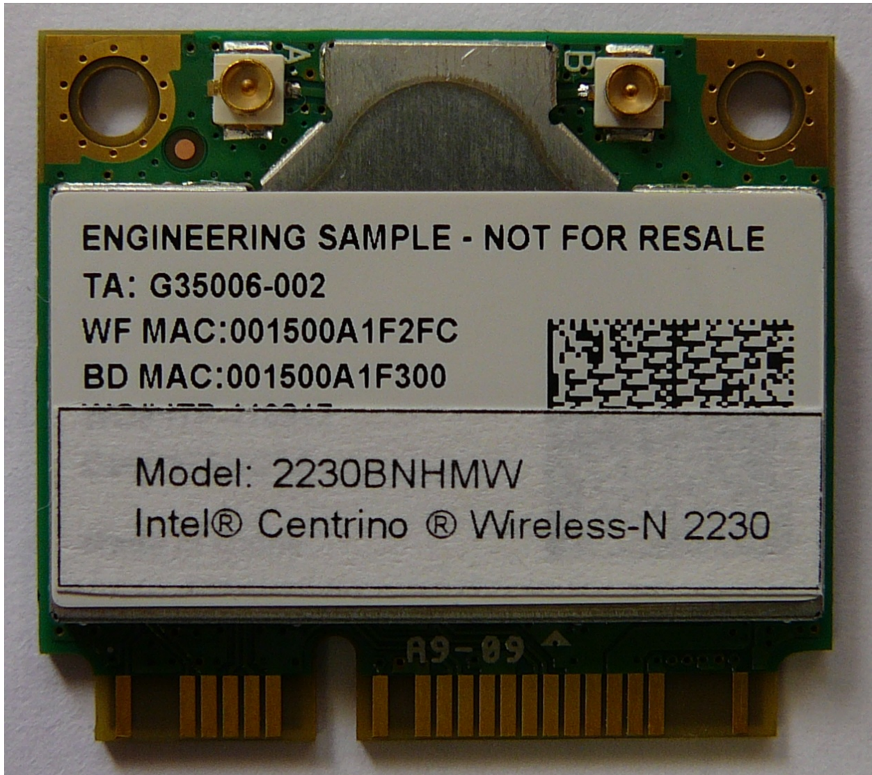
Photo shows label placement on half mini-card.

Label wraps around onto other side of the board.