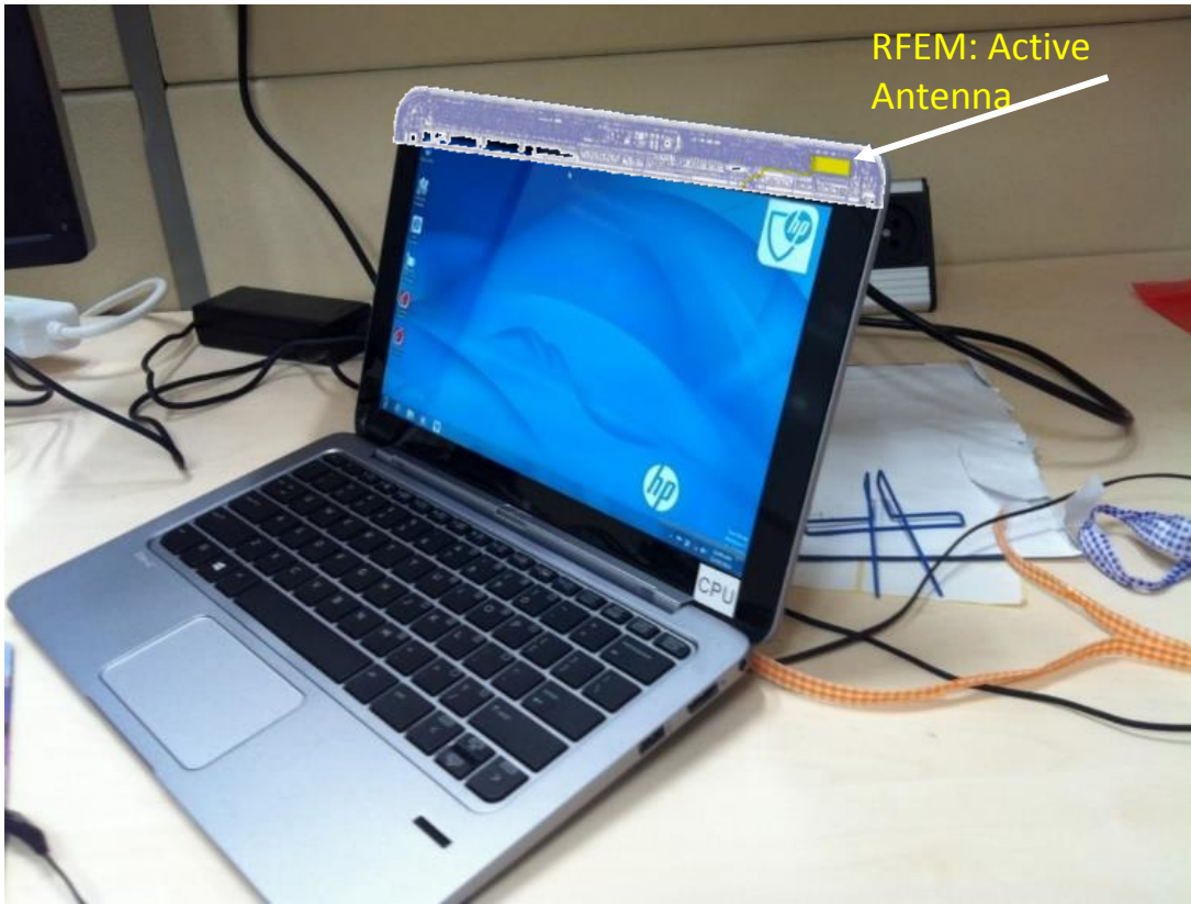
Figure 2– Intel 17265NGW LC module picture