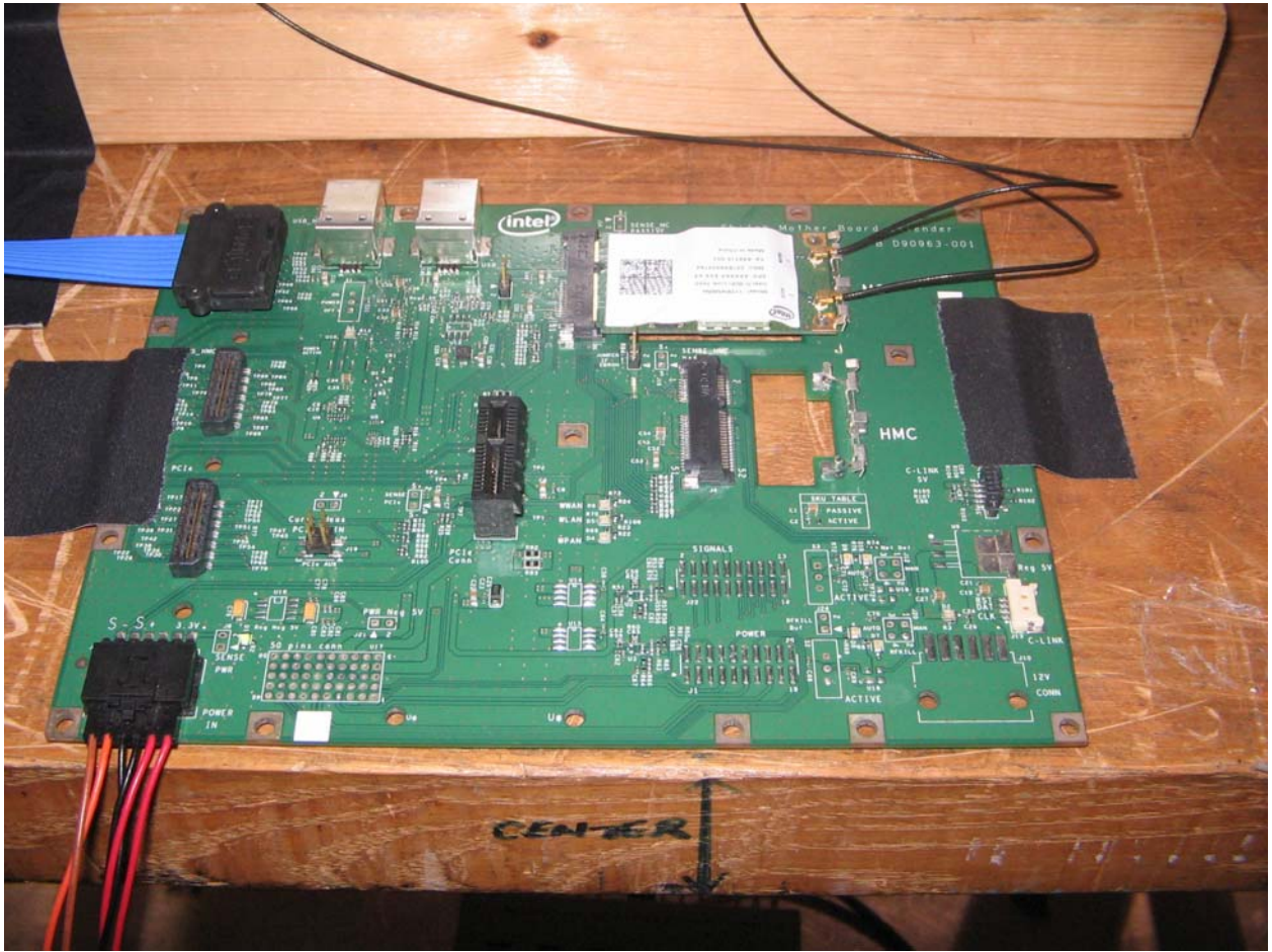
Card installed in test fixture, note cut-out from the PCB of the test fixture directly beneath the card.