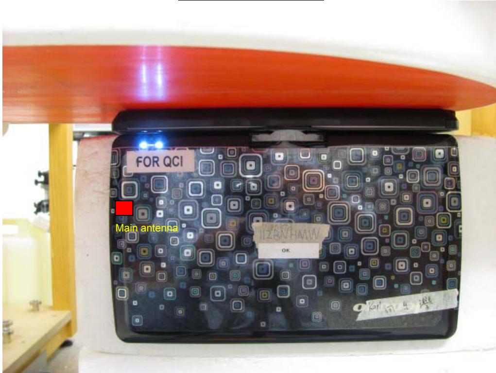
Laptop Mode - Lap held