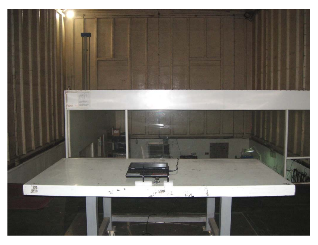
Back View of Radiated Test