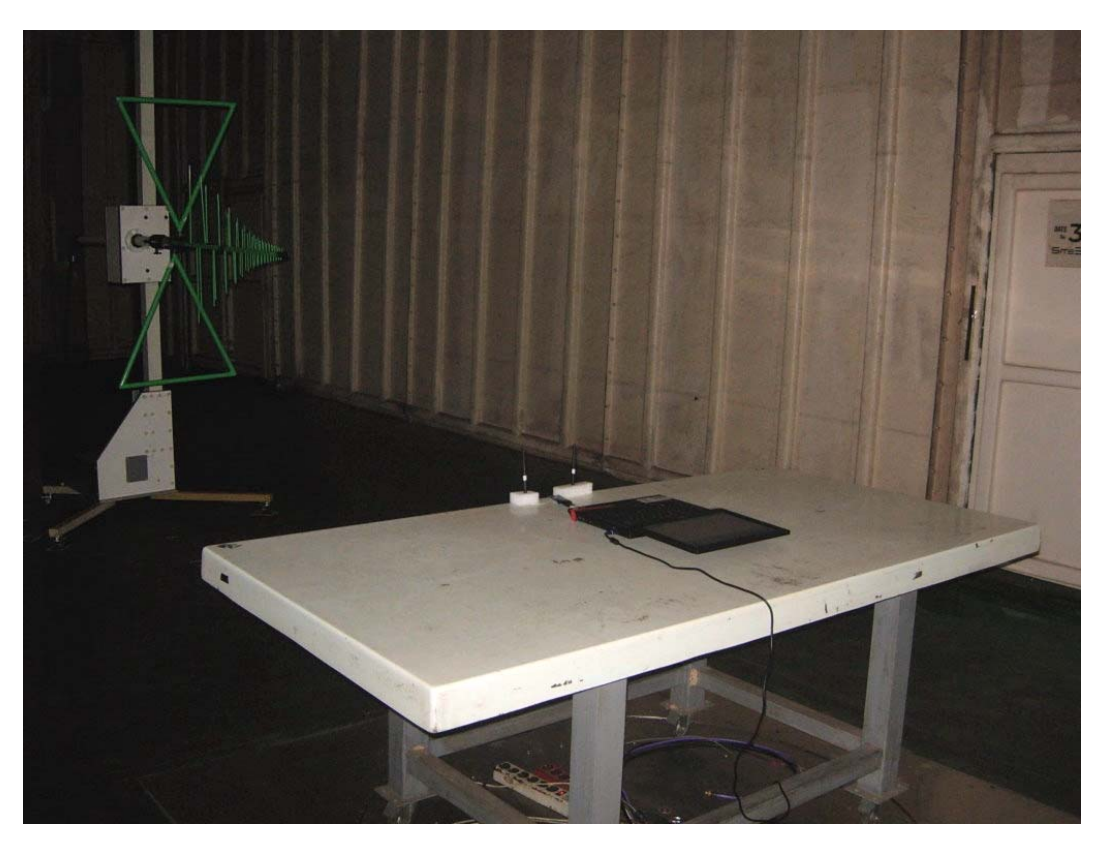
Front View of Radiated Test