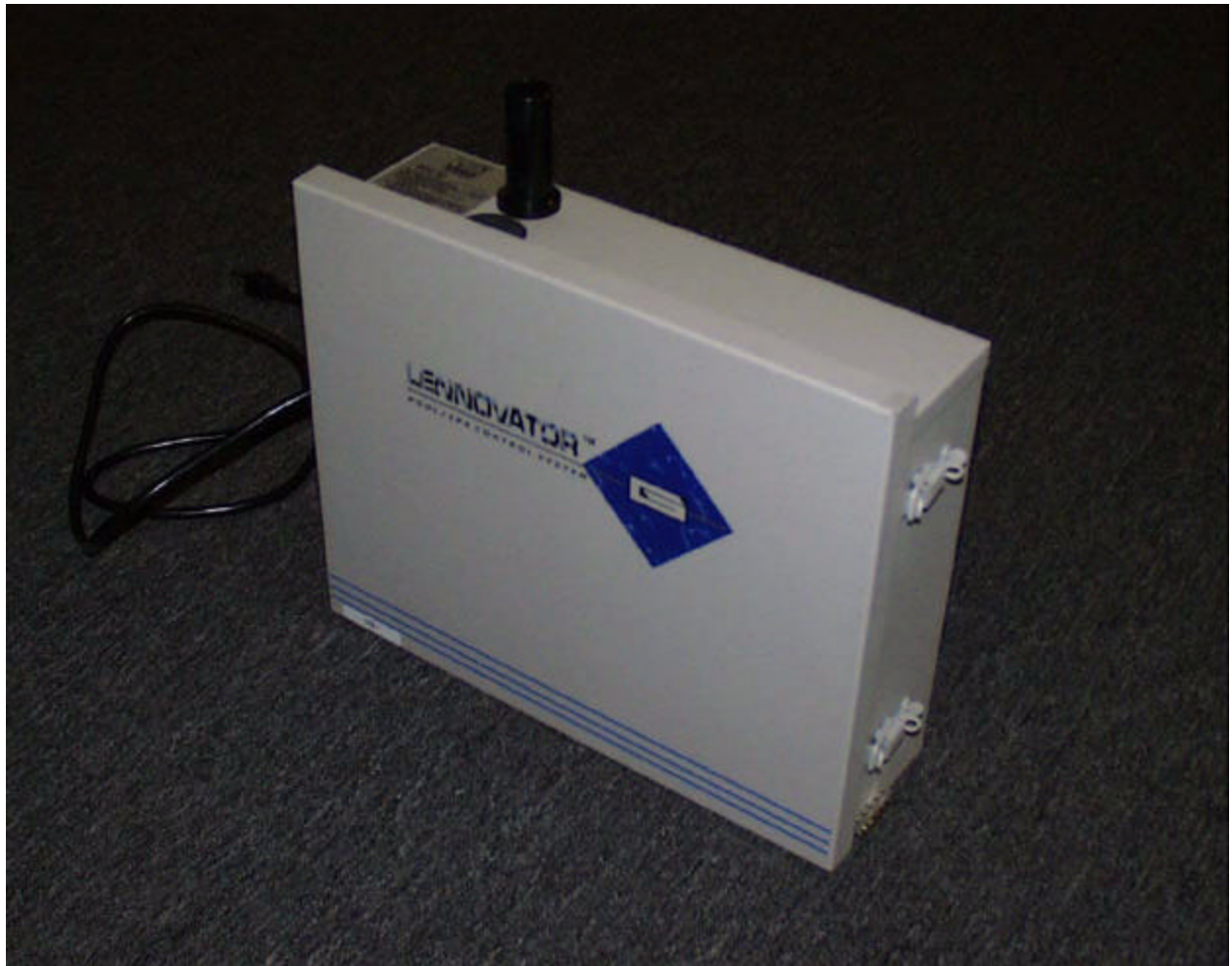
Outside, Front View