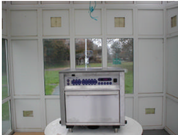
@ 10 metre