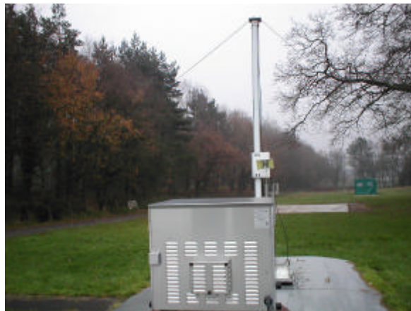
@ 3 metre

Note: This radiated emission setup shows the 208V, 60Hz variant, the test results of which also characterise the 240V, 60Hz variant due to the use of identical components and circuitry likely to act as radiating sources.