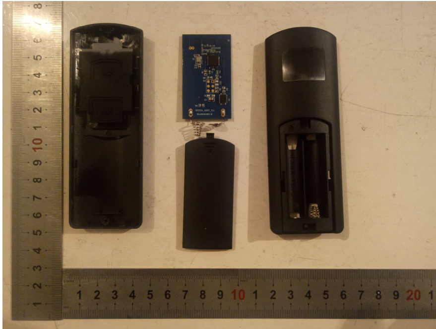
EUT – PCB Top View