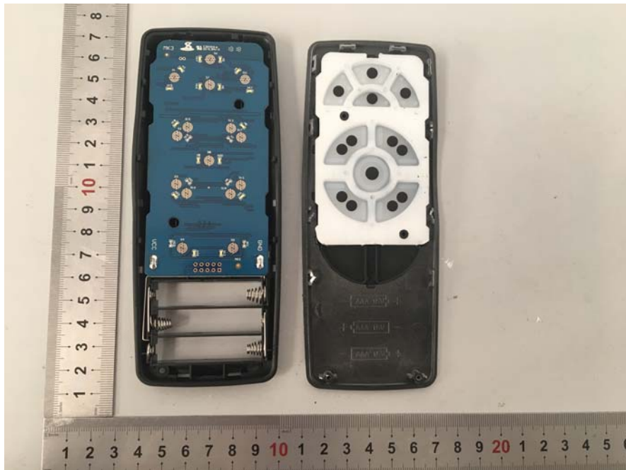
EUT – Cover off View-2