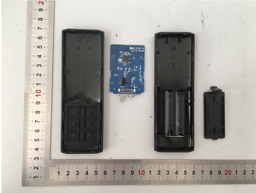
EUT – PCB Top View