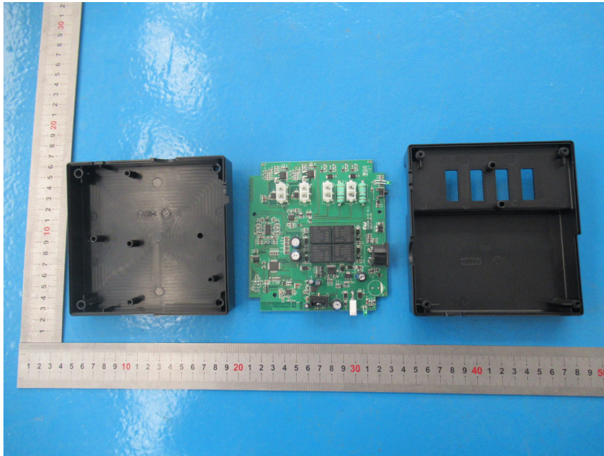
EUT – PCB Top View