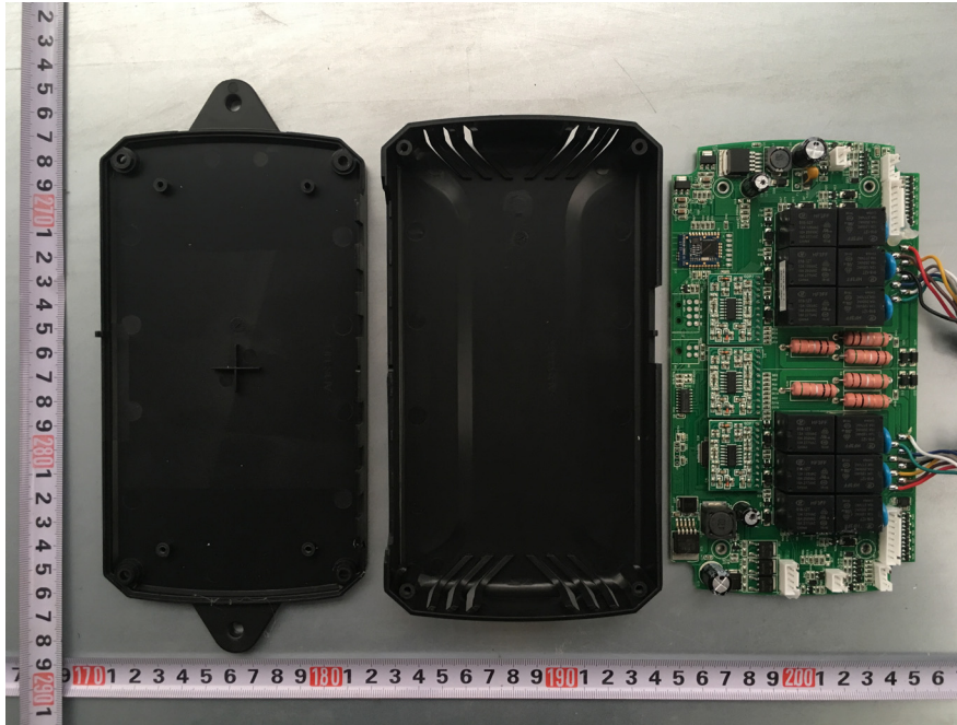
EUT – PCB Top View