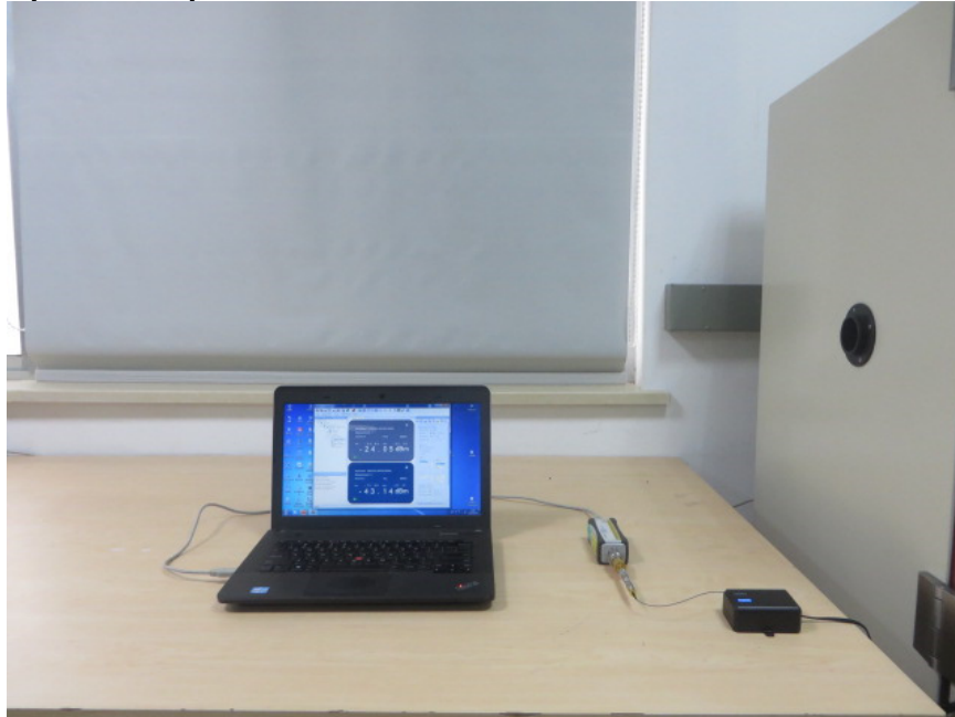
Photograph 1: Set-up for Conducted Test