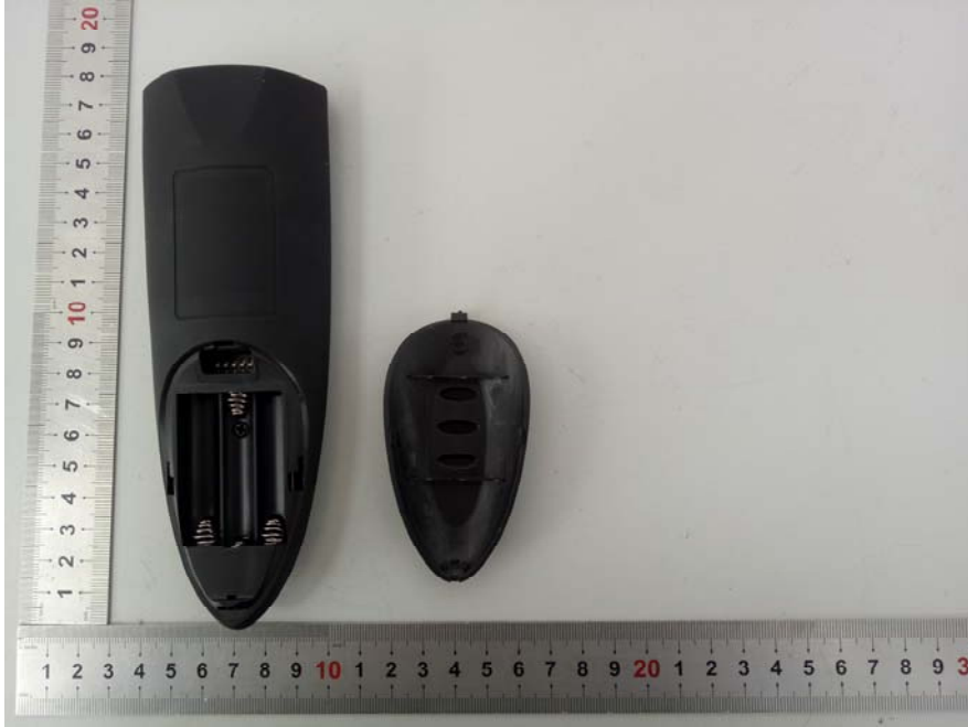
EUT – Cover off View-2