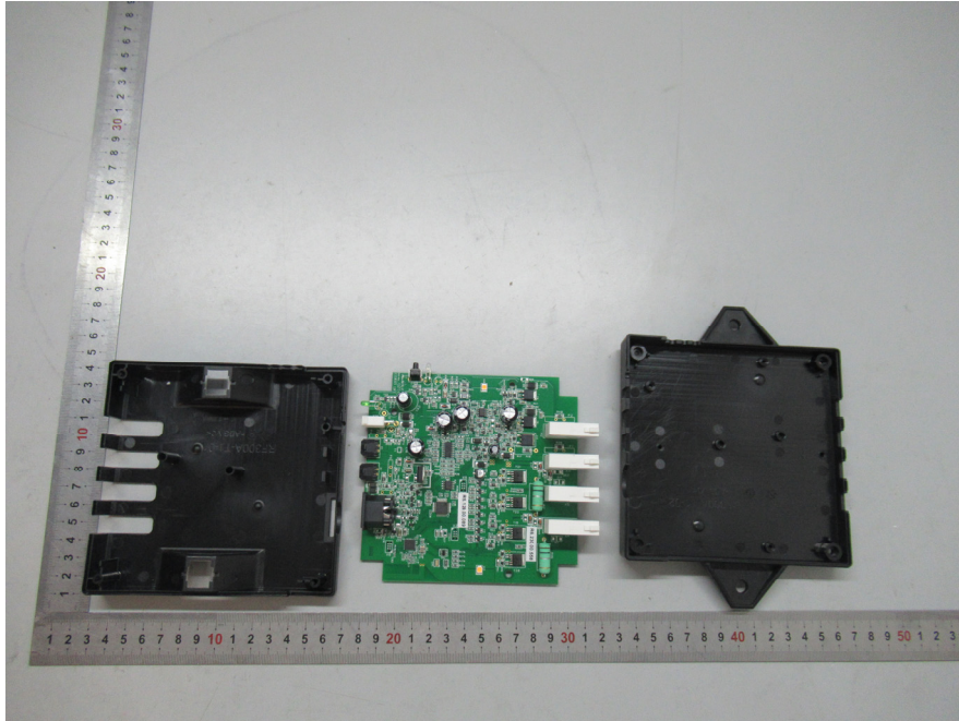
EUT – PCB Top View