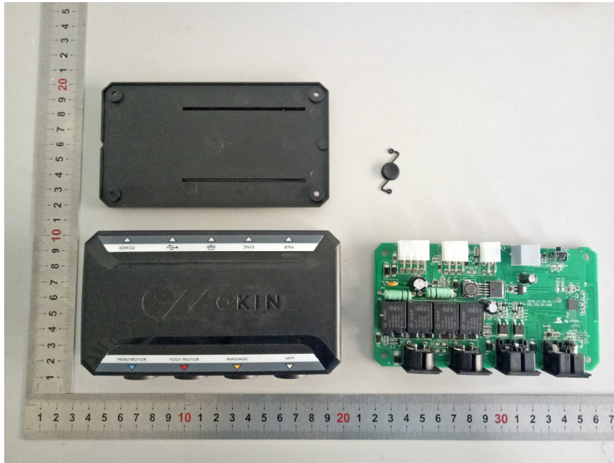
EUT – PCB Top View