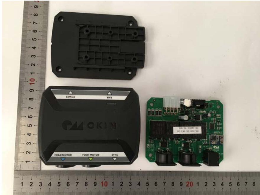
EUT – PCB Top View