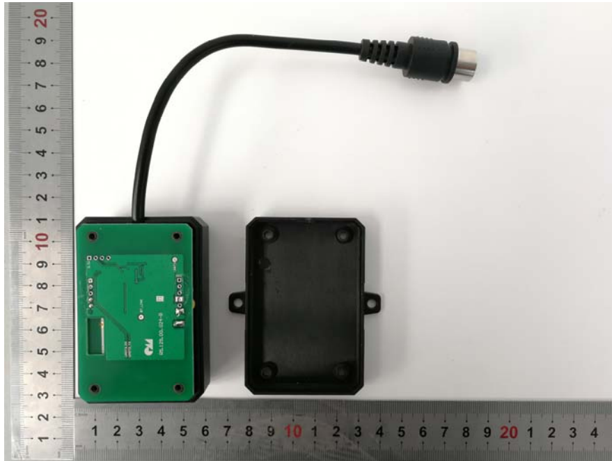
EUT – Cover off View-2