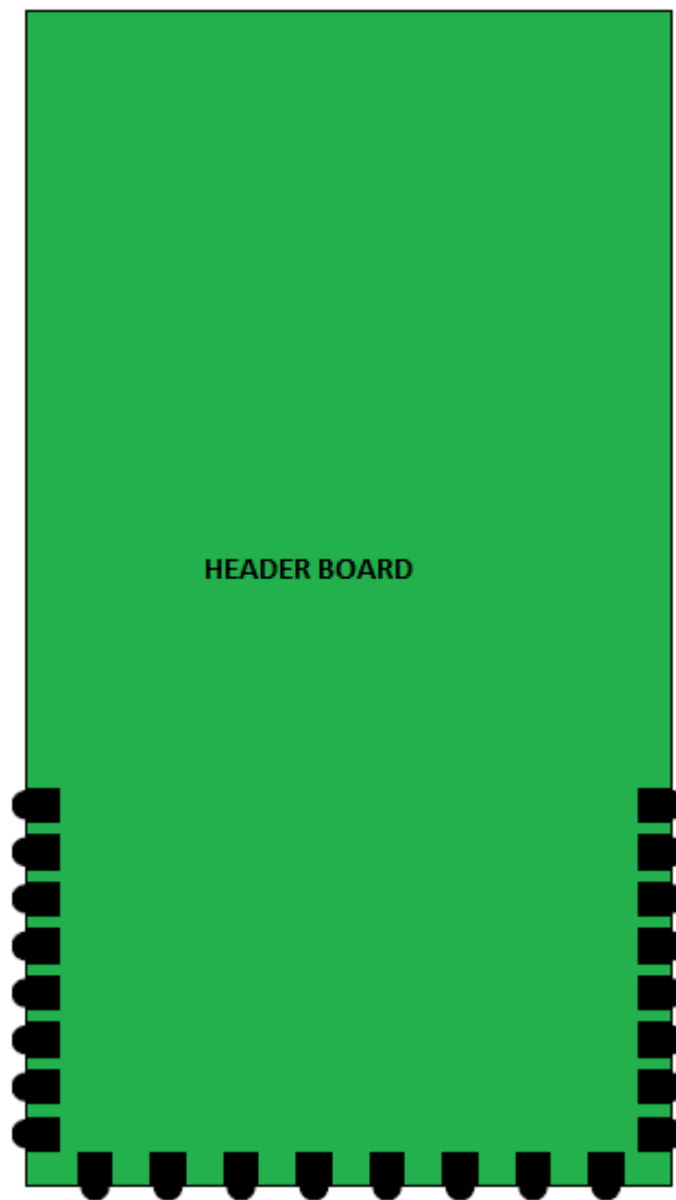
Figure 2: Header Board Footprint Overview

Below figure shows the footprint detail of the SREXGM3 Header board.