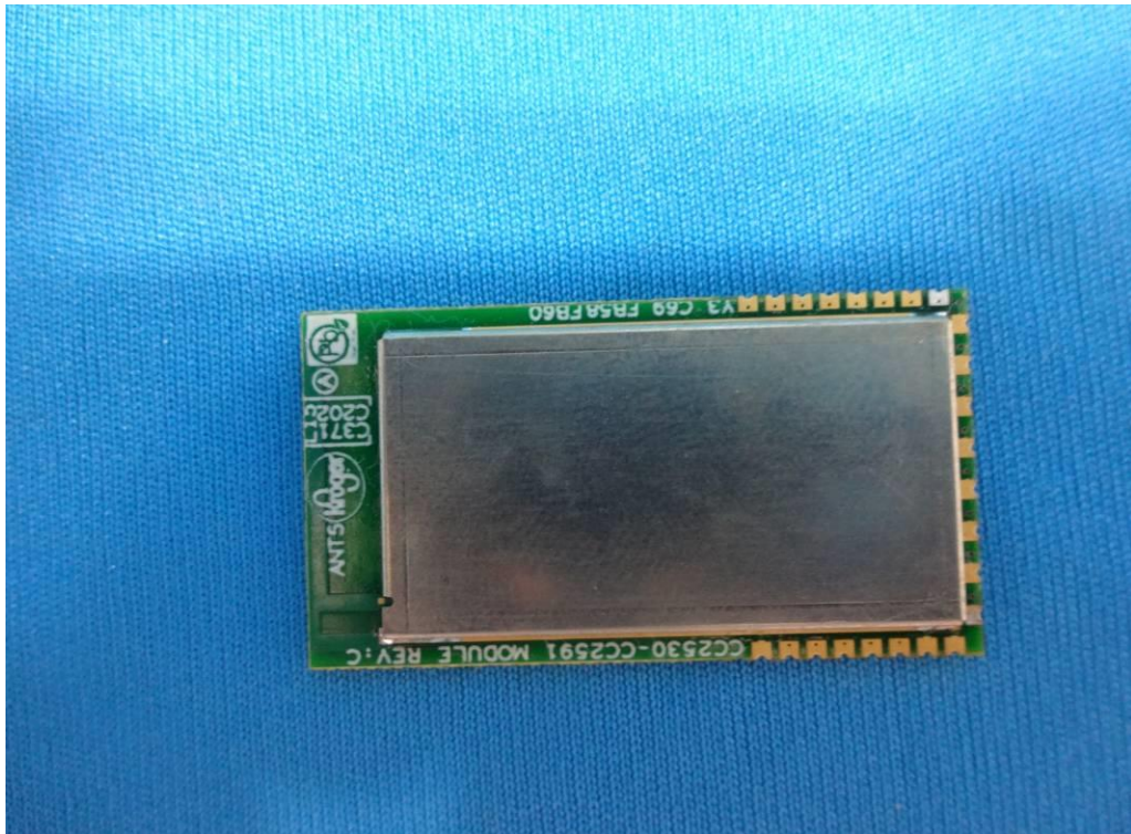
Module Top View