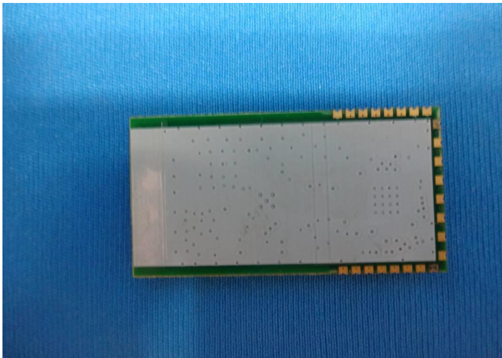
Module Bottom View