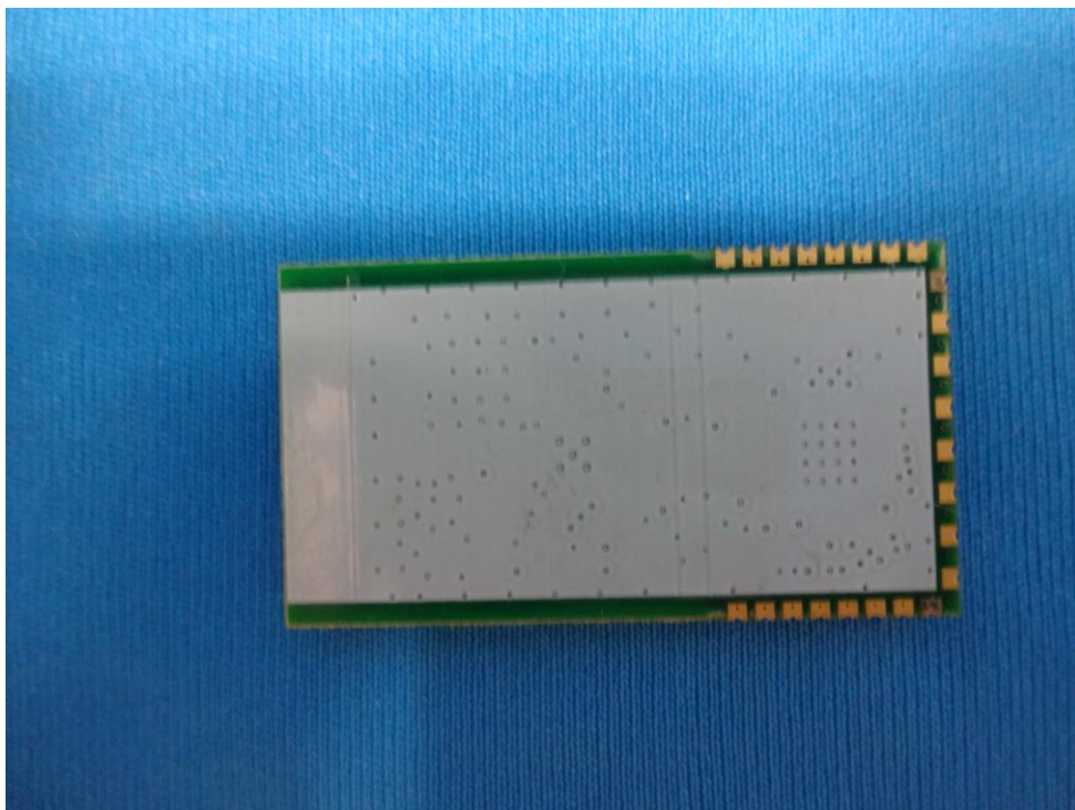
Module Bottom View