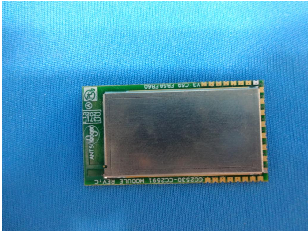
Module Top View