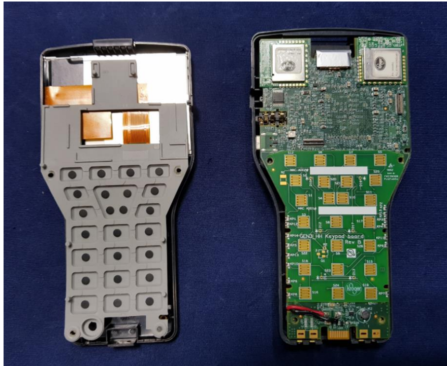
EUT Panel Removed