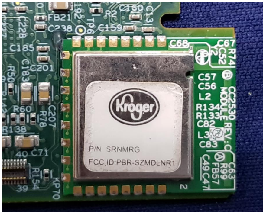
Module Close Up