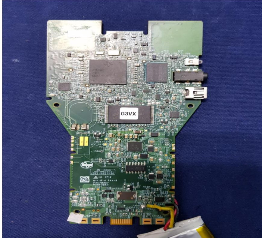
PCB Rear View