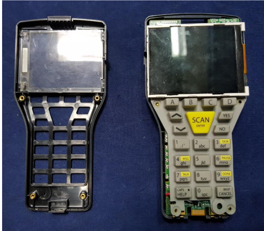
EUT Panel Removed