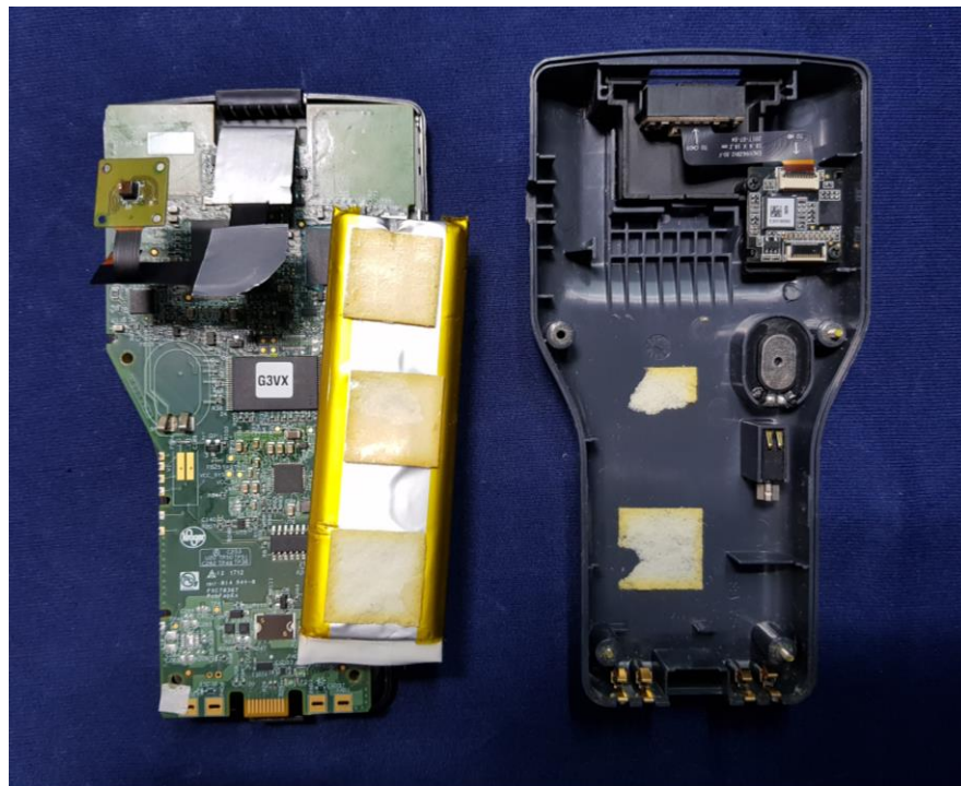
EUT Panel Removed