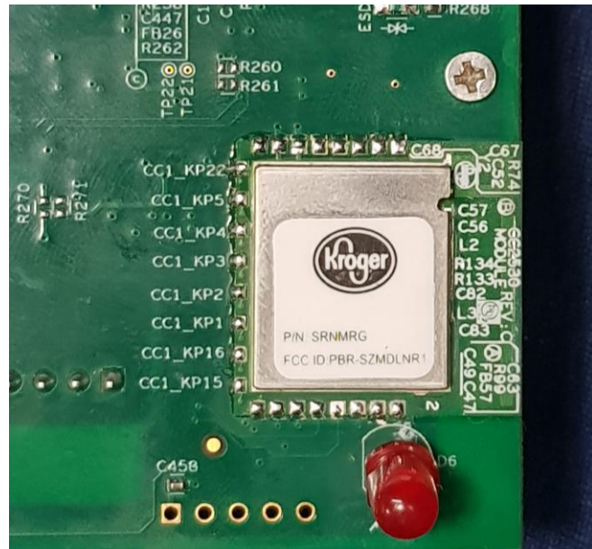
Module Close Up