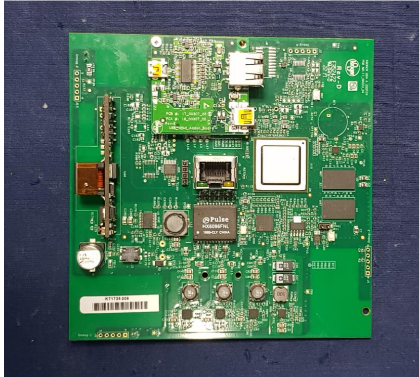
PCB Front View