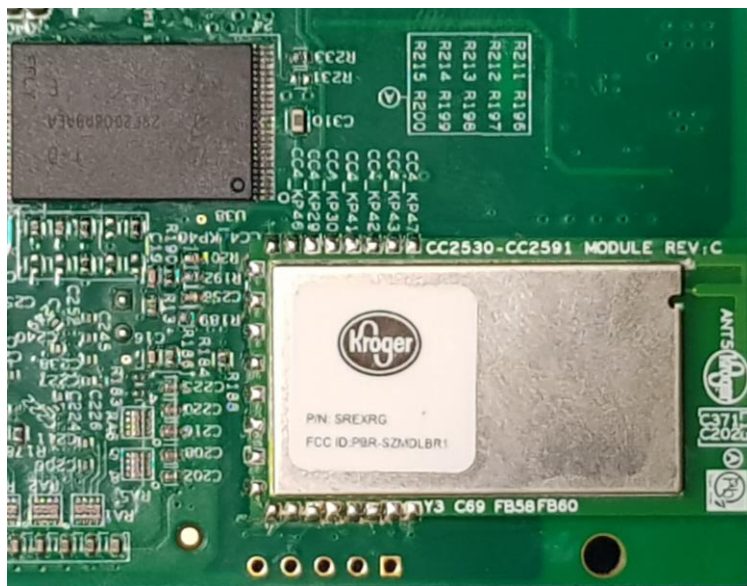
Module Close Up