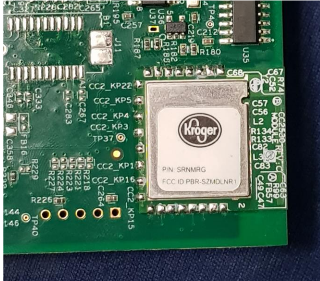
Module Close Up