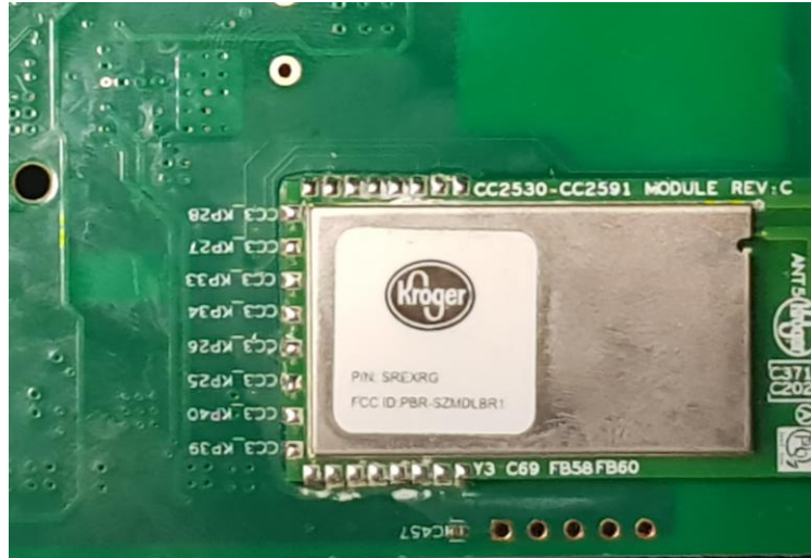
Module Close Up