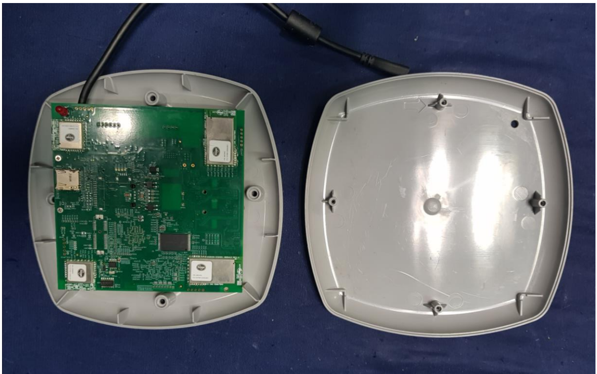
EUT Panel Removed