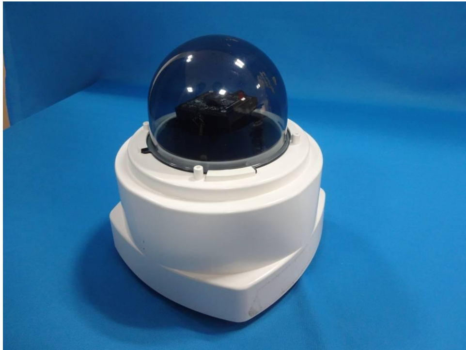
EUT Overall View