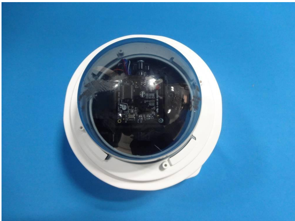
EUT Top View