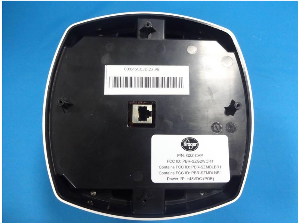
EUT Bottom View