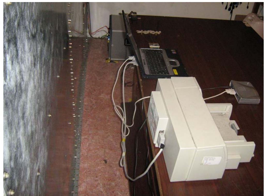
End of report