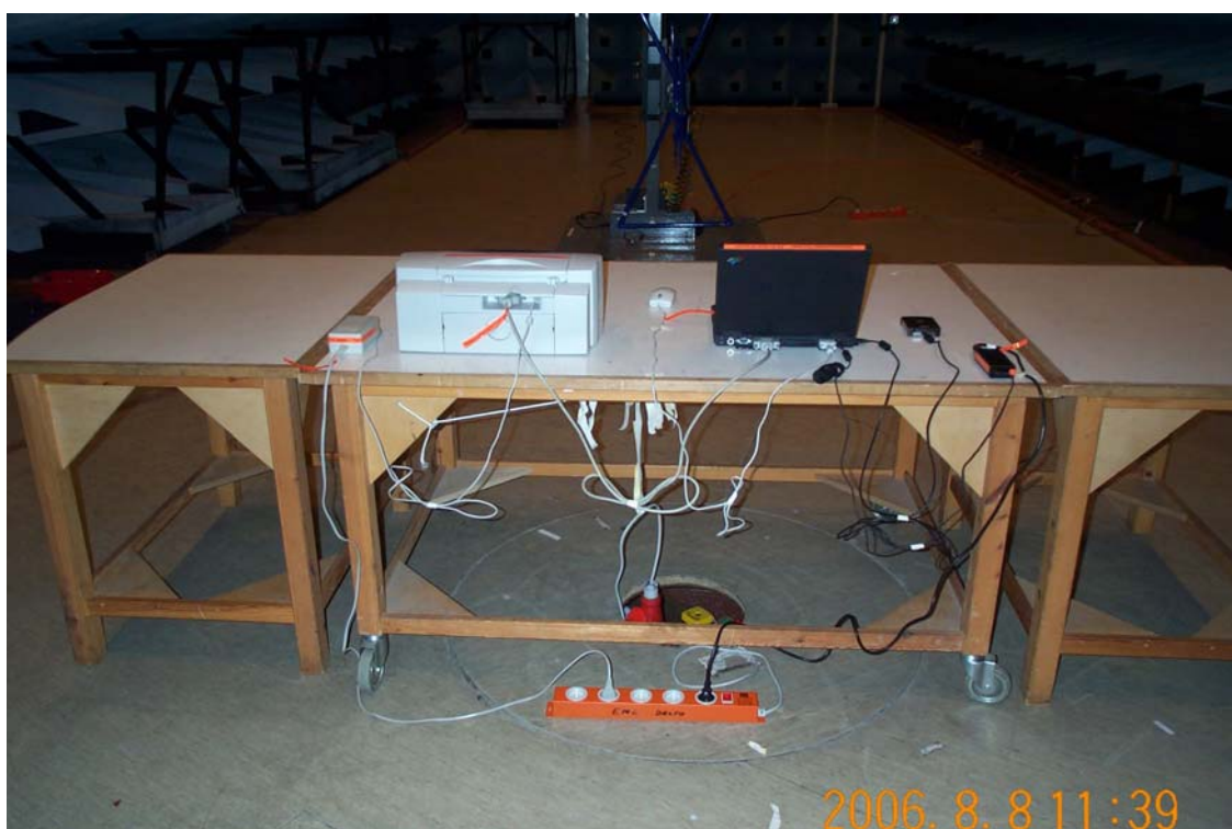
Photo 4.2.2 Field measurement test setup.