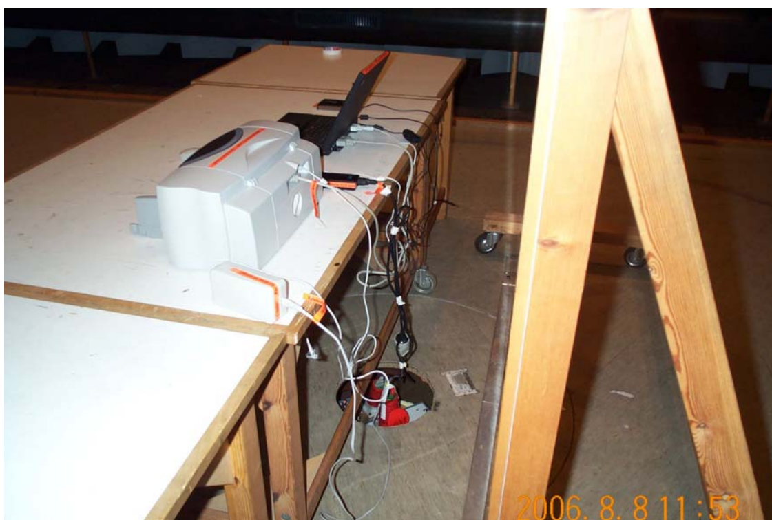
Photo 4.1.2 Test setup regarding measurement of RF voltage on AC mains.