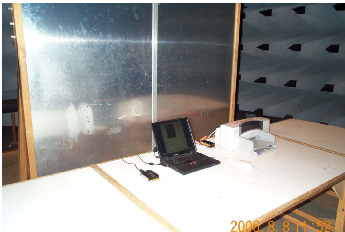
Photo 4.1.1 Test setup regarding measurement of RF voltage on AC mains.