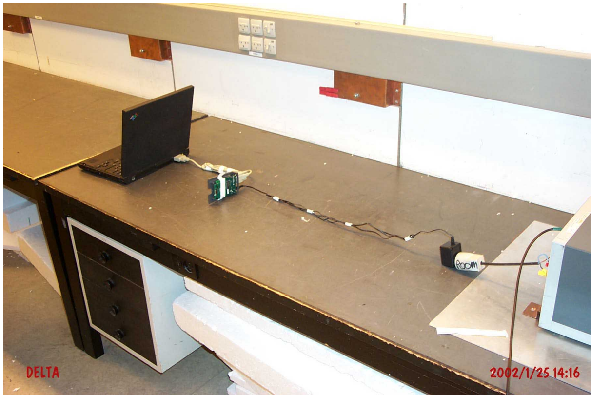
Photo 1 FCC Conducted emission on AC mains port