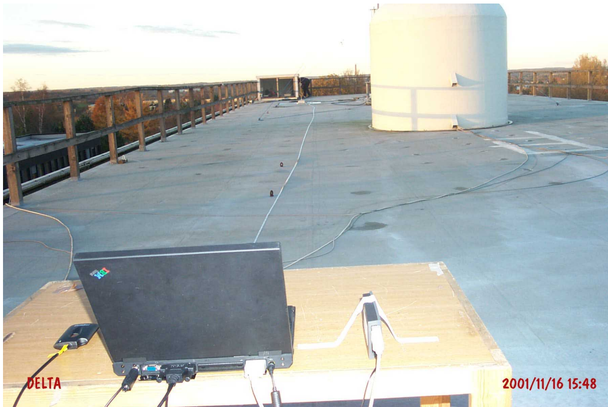
Photo 5 Radiated measurements on 30 m OATS