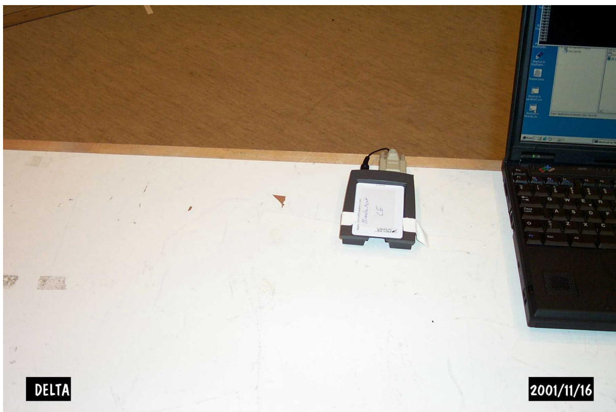
Photo 2 EUT with card