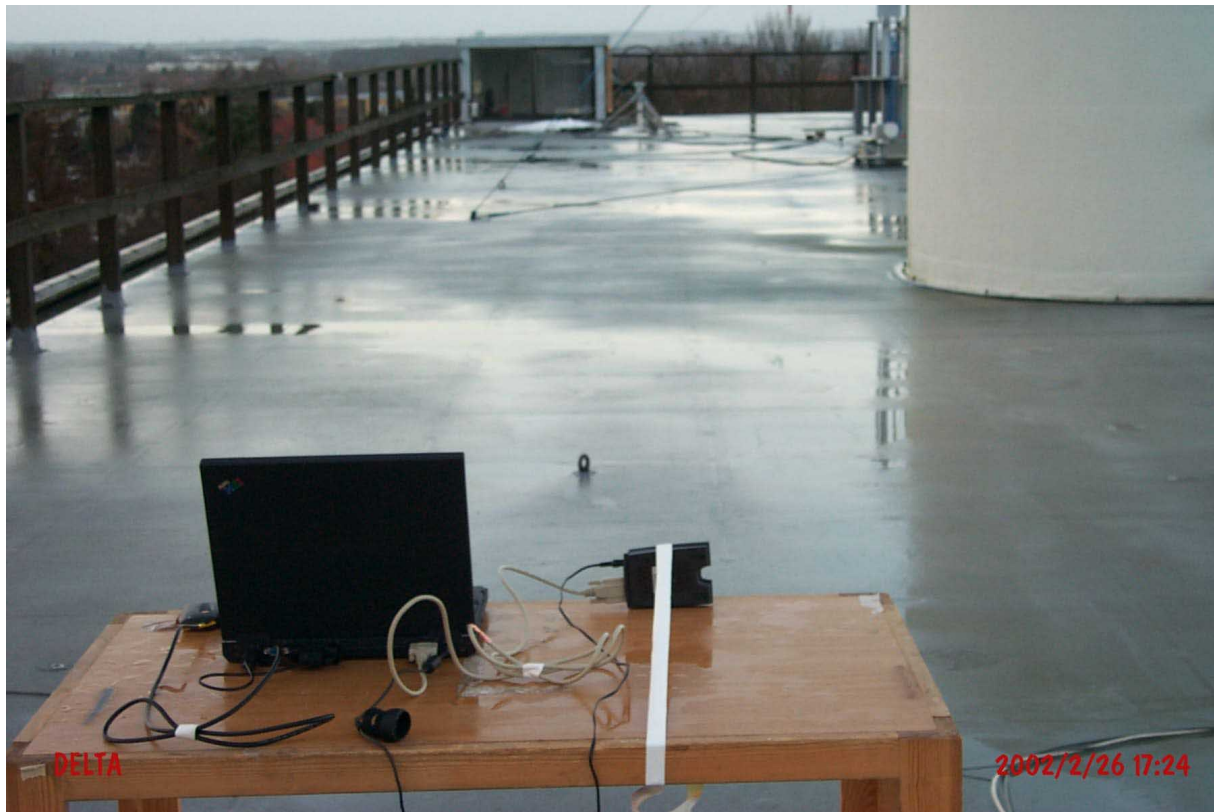
Photo 5 Radiated measurements using magnetic loop. 13 MHz to 30 MHz on 30 m OATS. EUT shown in position with maximum radiation.