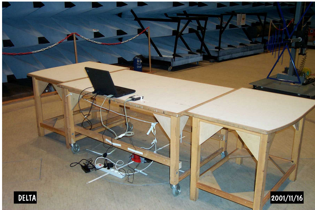
Photo 3 FCC Radiated emission 30 - 1000 MHz.