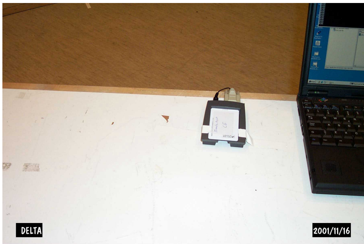
Photo 2 EUT with card.