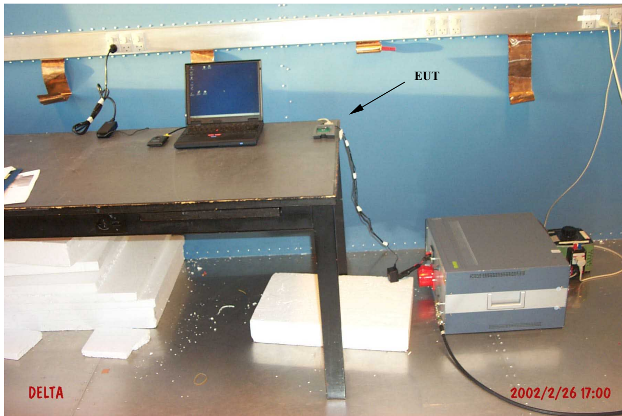
Photo 1 FCC Conducted emission on AC mains port.