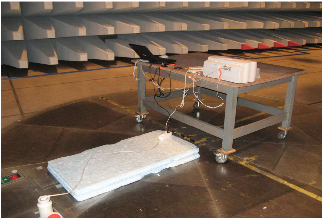
Photo 4.2.2 Test setup regarding measurement of radio frequency electromagnetic field. Side view.