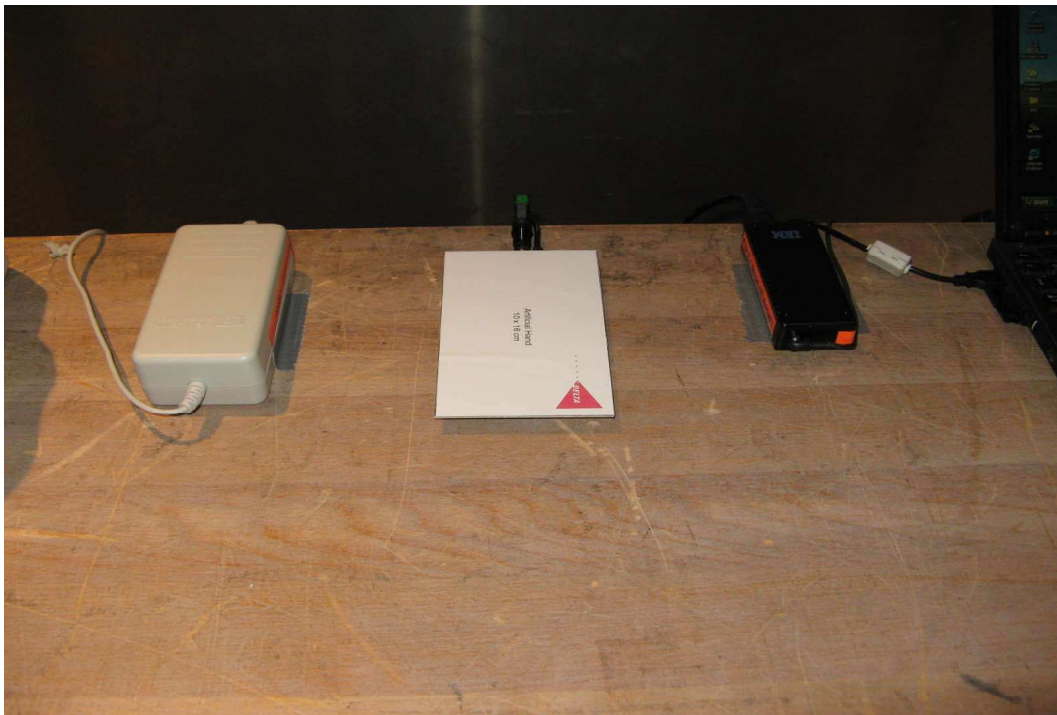
Photo 4.1.2 Test setup regarding measurement of radio frequency voltage on mains with an artificial hand applied to the test object.