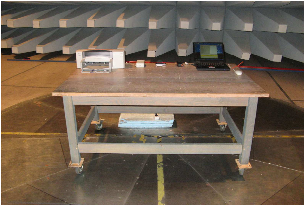
Photo 4.2.1 Test setup regarding measurement of radio frequency electromagnetic field. Front view.