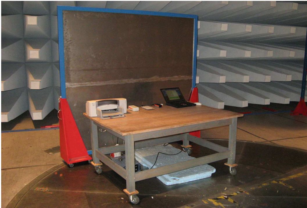
Photo 4.1.1 Test setup regarding measurement of radio frequency voltage on mains.