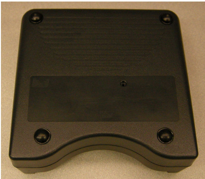
Bottom of Device Without Label