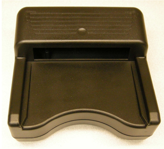
Top of Device