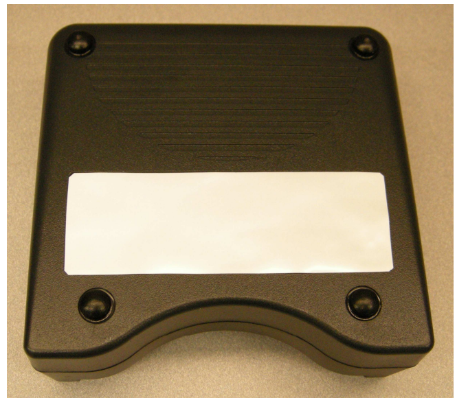
Bottom of Device With Blank Label