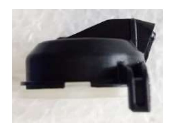
Left side view of Transmitter