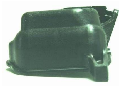
Left side view of Transmitter