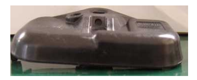
Right side view of Transmitter