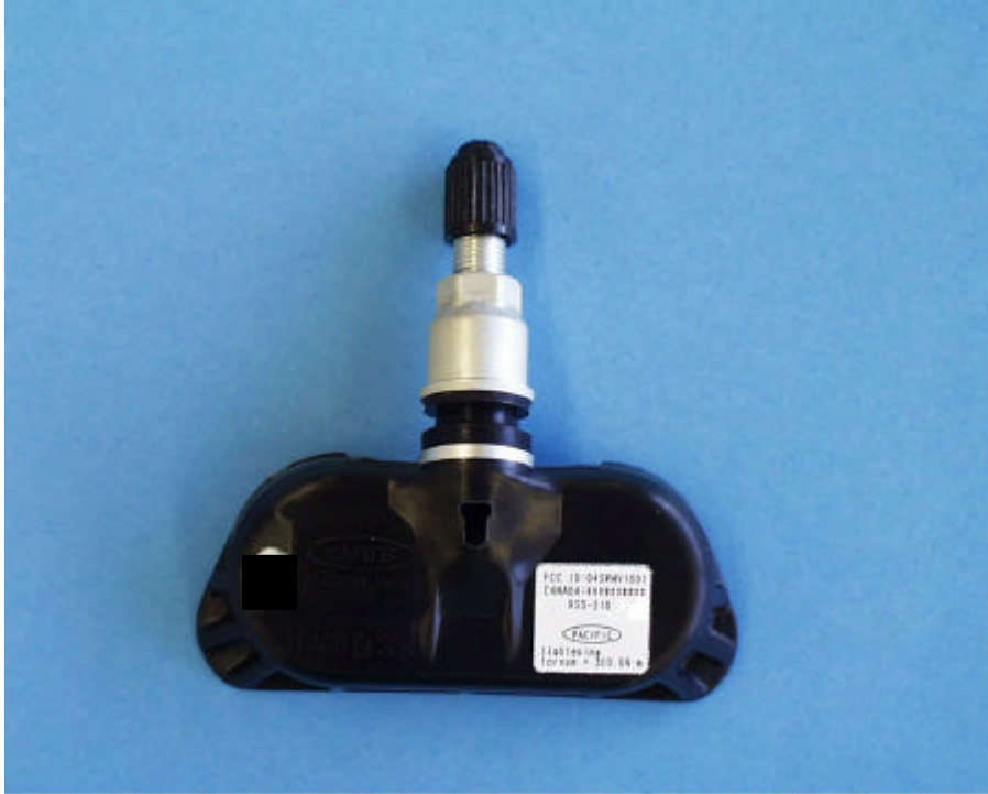
Bottom view of Transmitter