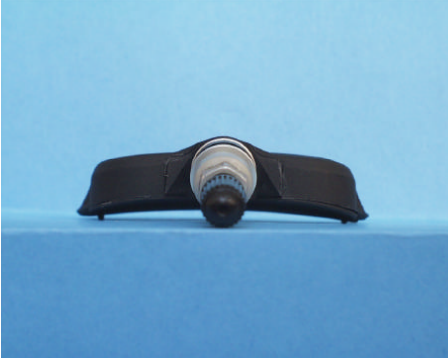
Rear view of Transmitter