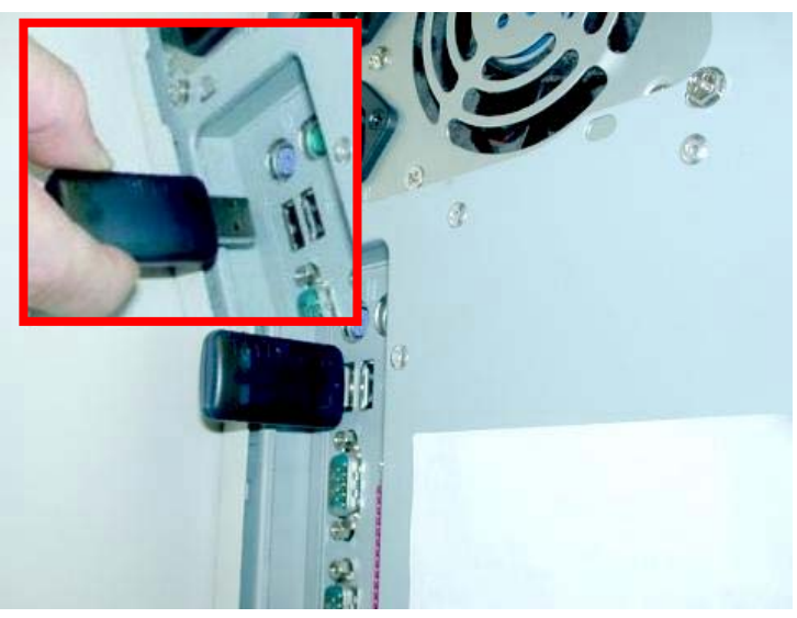
Figure 2-10: Plug the Bluetooth USB Adapter into USB port on desktop PC

The Bluetooth USB Adapter can be used by both desktop and laptop PC with USB port as shown below: