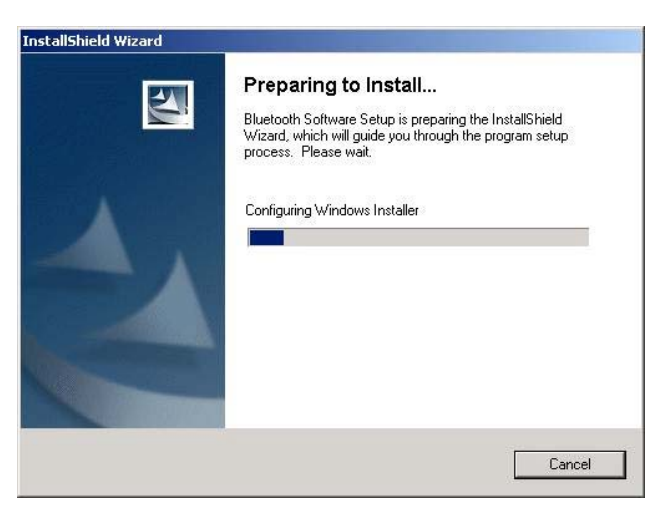
Figure 2-1: Preparing to Install Widcomm Bluetooth Software

Insert the Bluetooth Software CD into CD-ROM drive. If the Auto-Run function of CD-ROM is enabled (in Windows, the default setting of this function is usually enabled), installation program will start automatically. If not, you can utilize the Windows Explorer to browse CD content and run Setup.exe manually.