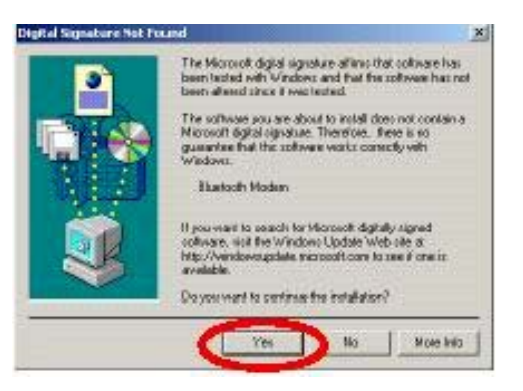
Figure 2-5: Digital Signature dialog box

Note: During the processing of the Bluetooth Software installation under Windows 98SE or Windows 2000, it is possible to meet Microsoft Digital Signature issues such as Bluetooth Personal Area Network Driver, Bluetooth Communication Ports, Widcomm Bluetooth Null Modem, Widcomm Bluetooth Modem, Widcomm Bluetooth Fax Modem, and Unknown Software package. Please confirm them manually by pressing Yes button in these pop-up windows.