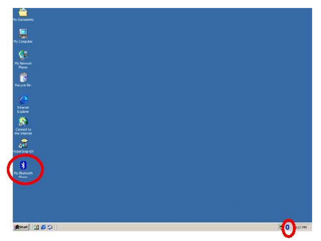
Figure 2-9: Bluetooth icons

After rebooting, when you log in Windows operating system there will be two new Bluetooth icons appearing on the desktop and the Windows System Tray respectively.