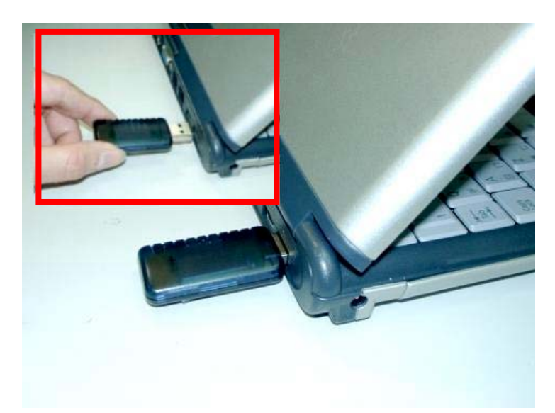
Figure 2-11: Plug the Bluetooth USB Adapter into USB port on laptop PC