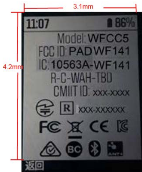
Display directly on the device's screen

4.2 Products must not require special accessories or supplemental plug-ins (e.g., the installation of a SIM/USIM card) to access the information.