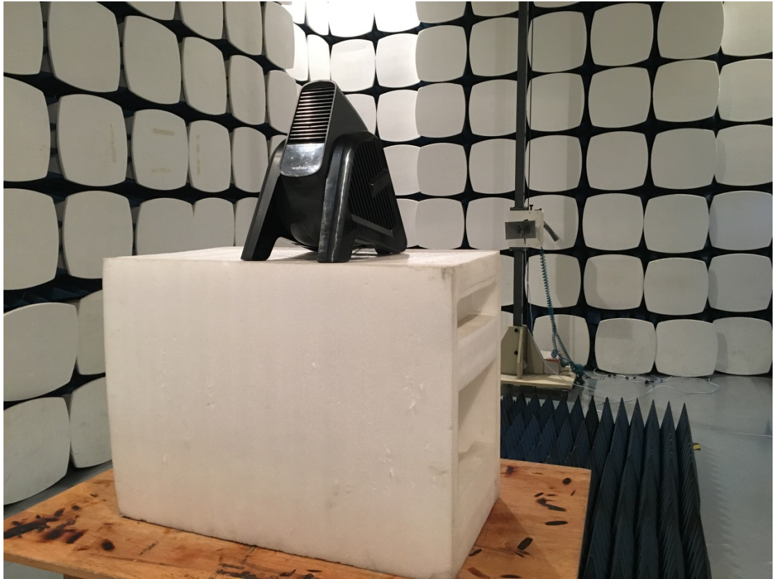
COMPLIANCE CERTIFICATION SERVICES (SHENZHEN) INC test above 1GHz emission