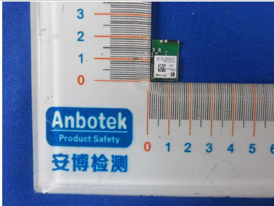
PCB of the EUT-Front View