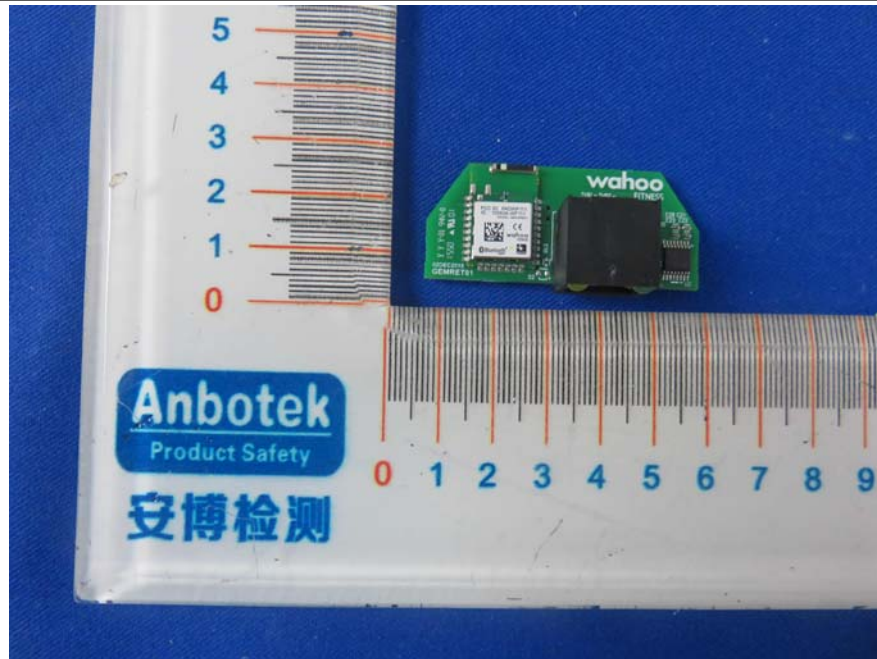
PCB of the EUT-Front View