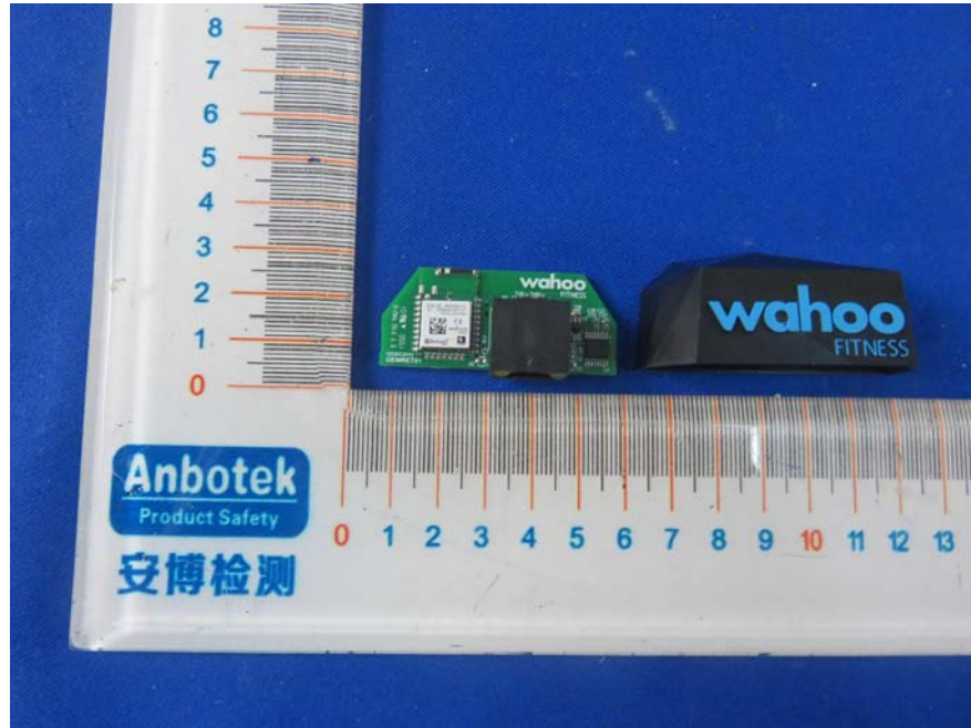
The EUT-Inside View