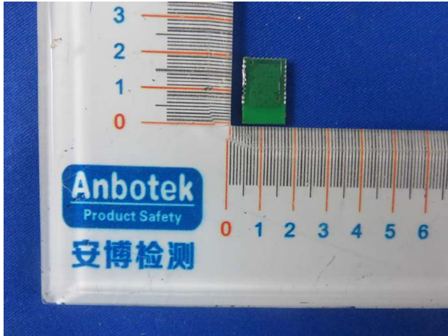
PCB of the EUT-Back View