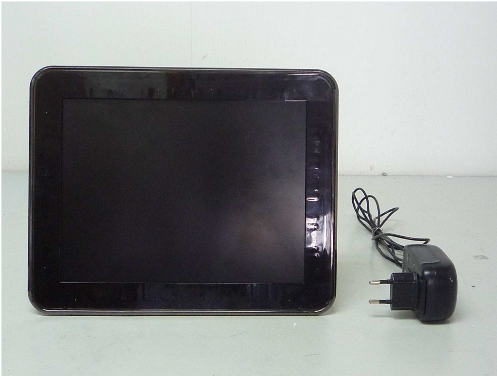
Figure 1. Overview with AC/DC adapter

Type Designation: W1030 Report Number: 17016854 001