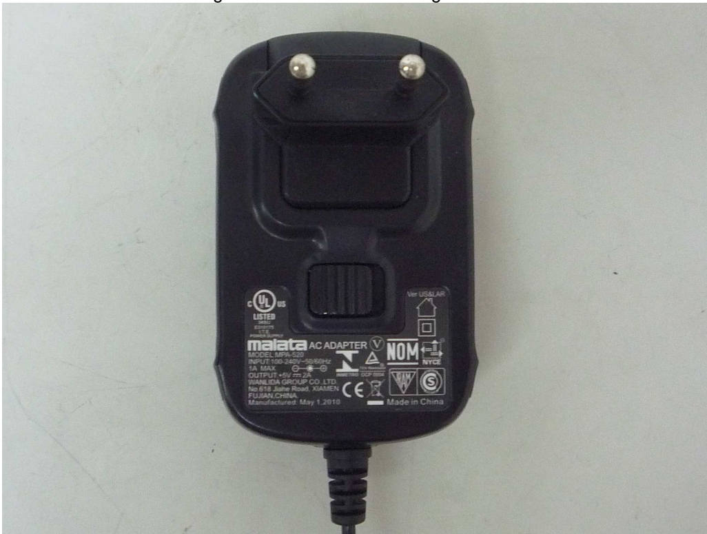
Figure 4. Overview of AC/DC adapter