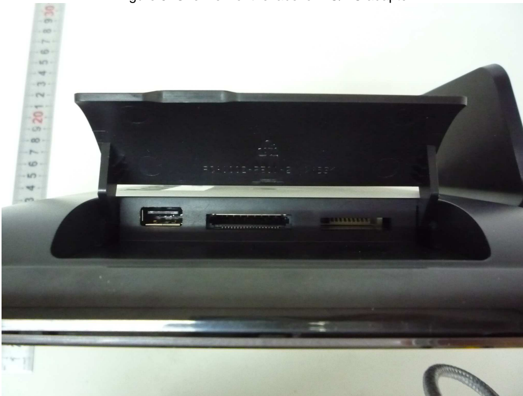
Figure 6. (Overview of the ports)