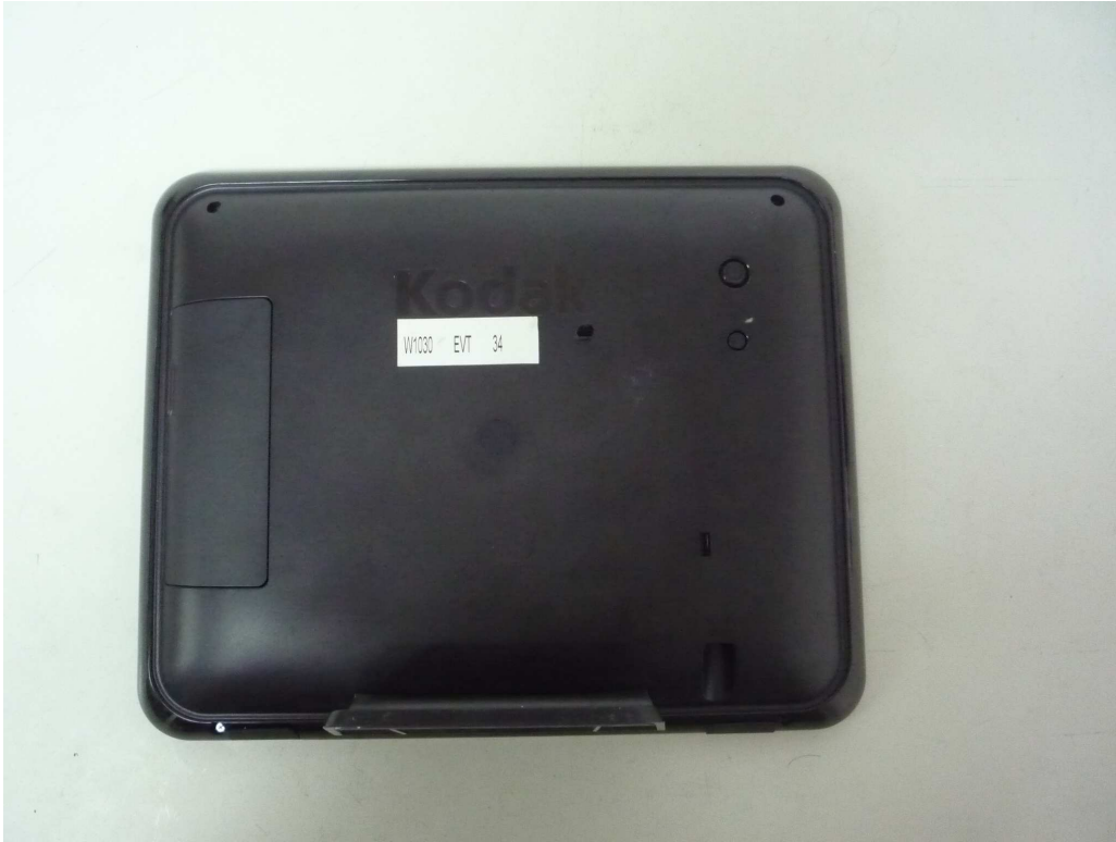
Figure 3. Rear overview of digital frame

Type Designation: W1030 Report Number: 17016854 001