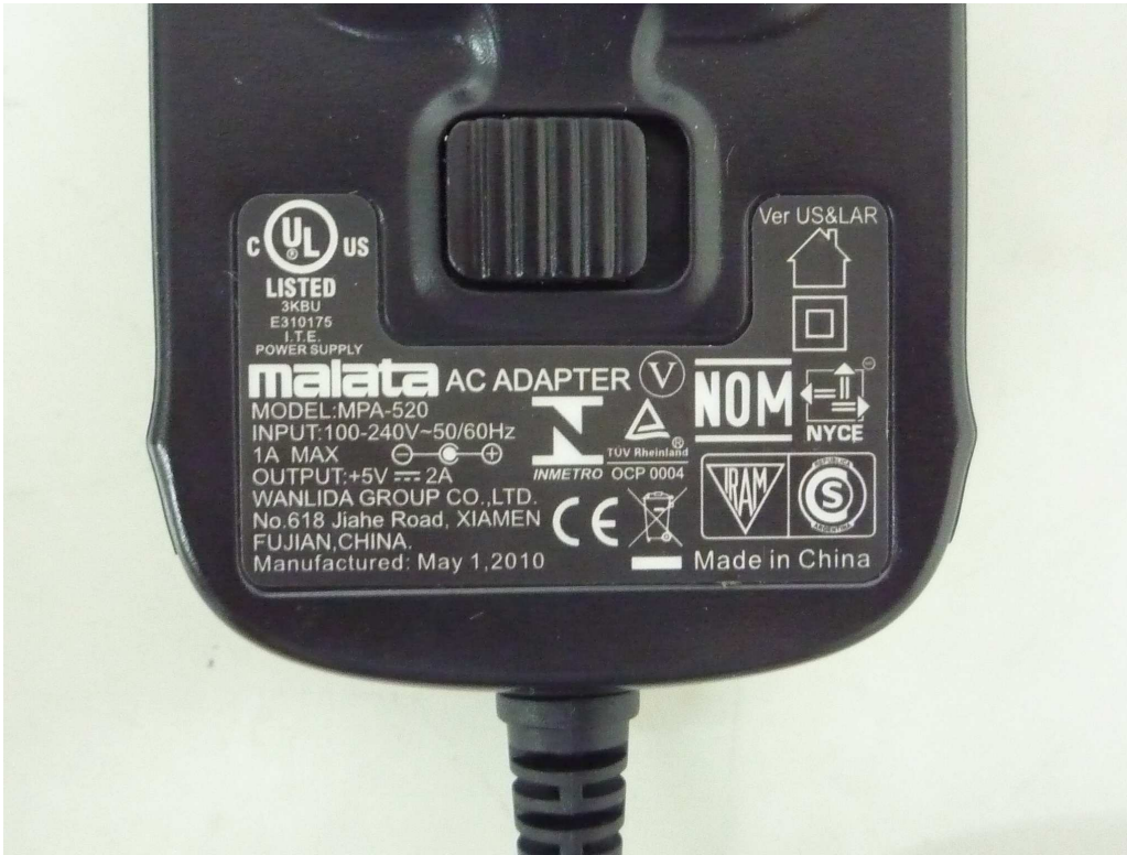
Figure 5. Overview of the label of AC/DC adapter

Type Designation: W1030 Report Number: 17016854 001