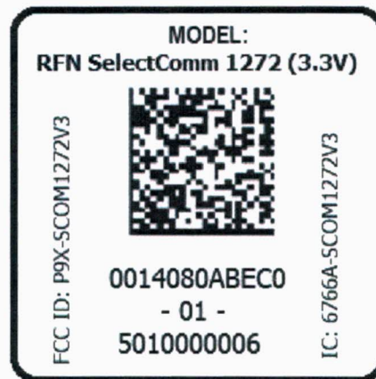
Figure 4: RFN SelectComm 1272 (3.3V) – Label Detail