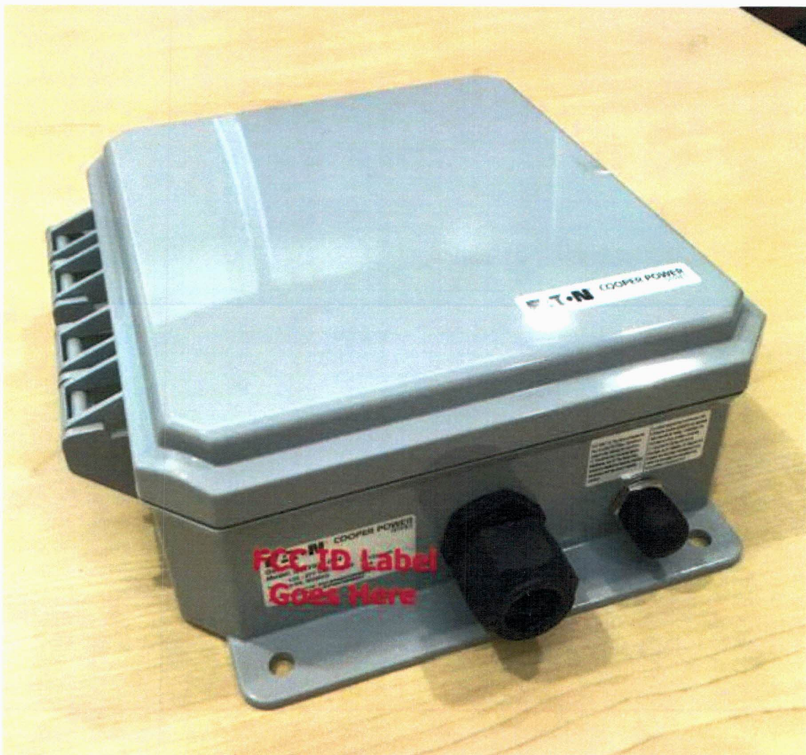
Figure 2: External Label Location