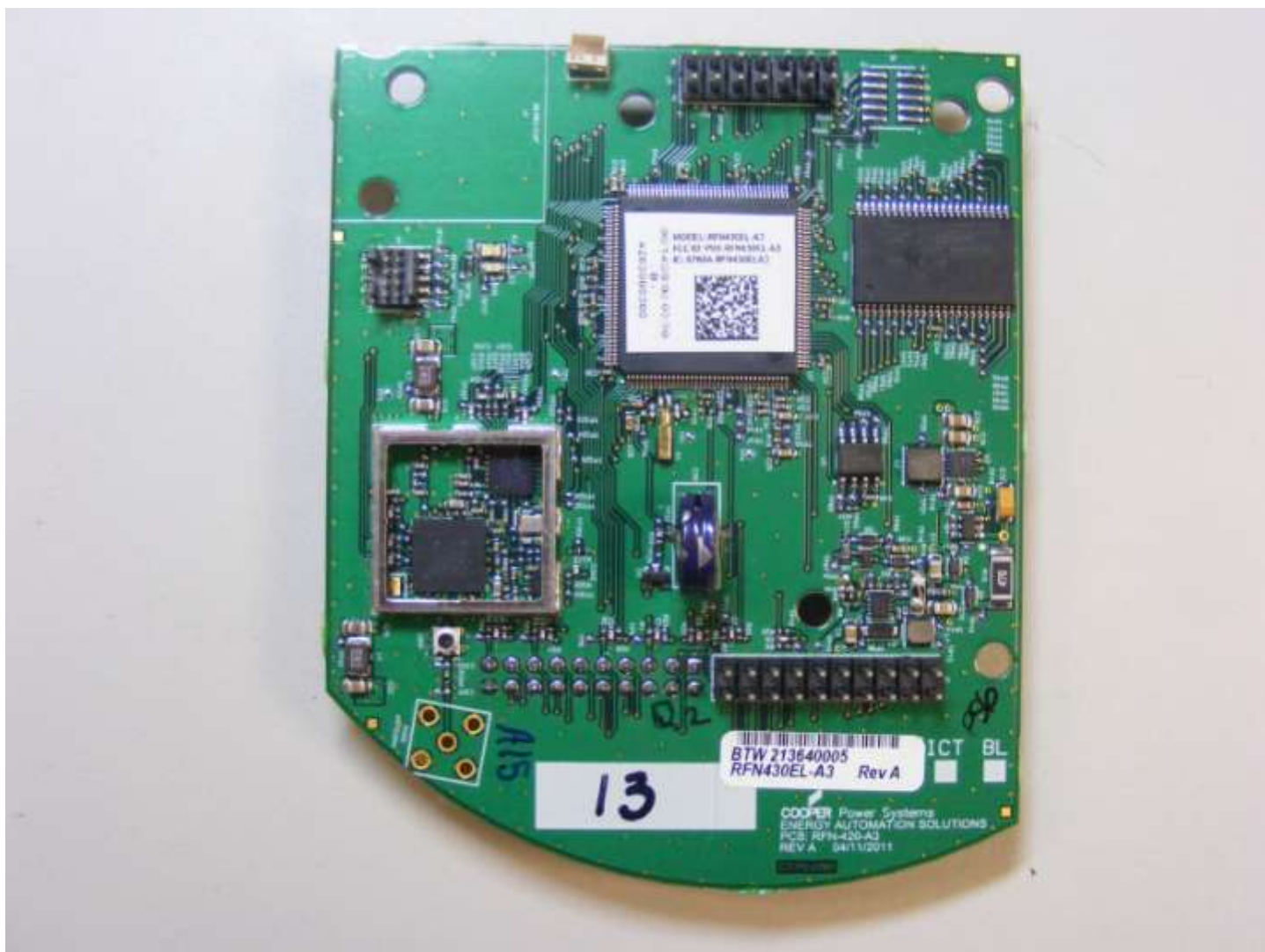
Figure 3: RFN430EL-A3 – Top, shields removed