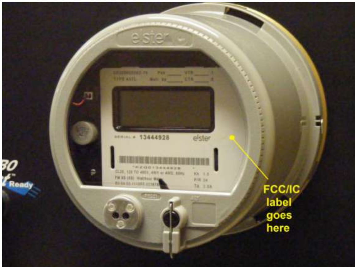
Figure 2: External Label Location