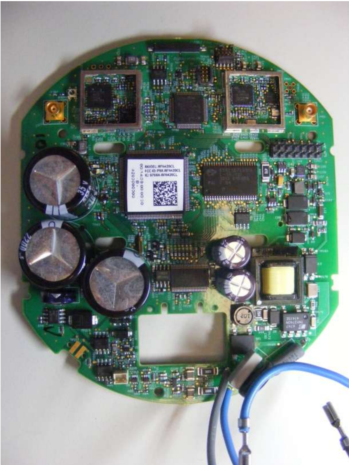
Figure 3: RFN420CL – Top, shields removed