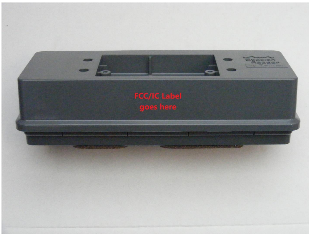
Figure 2: External Label Location