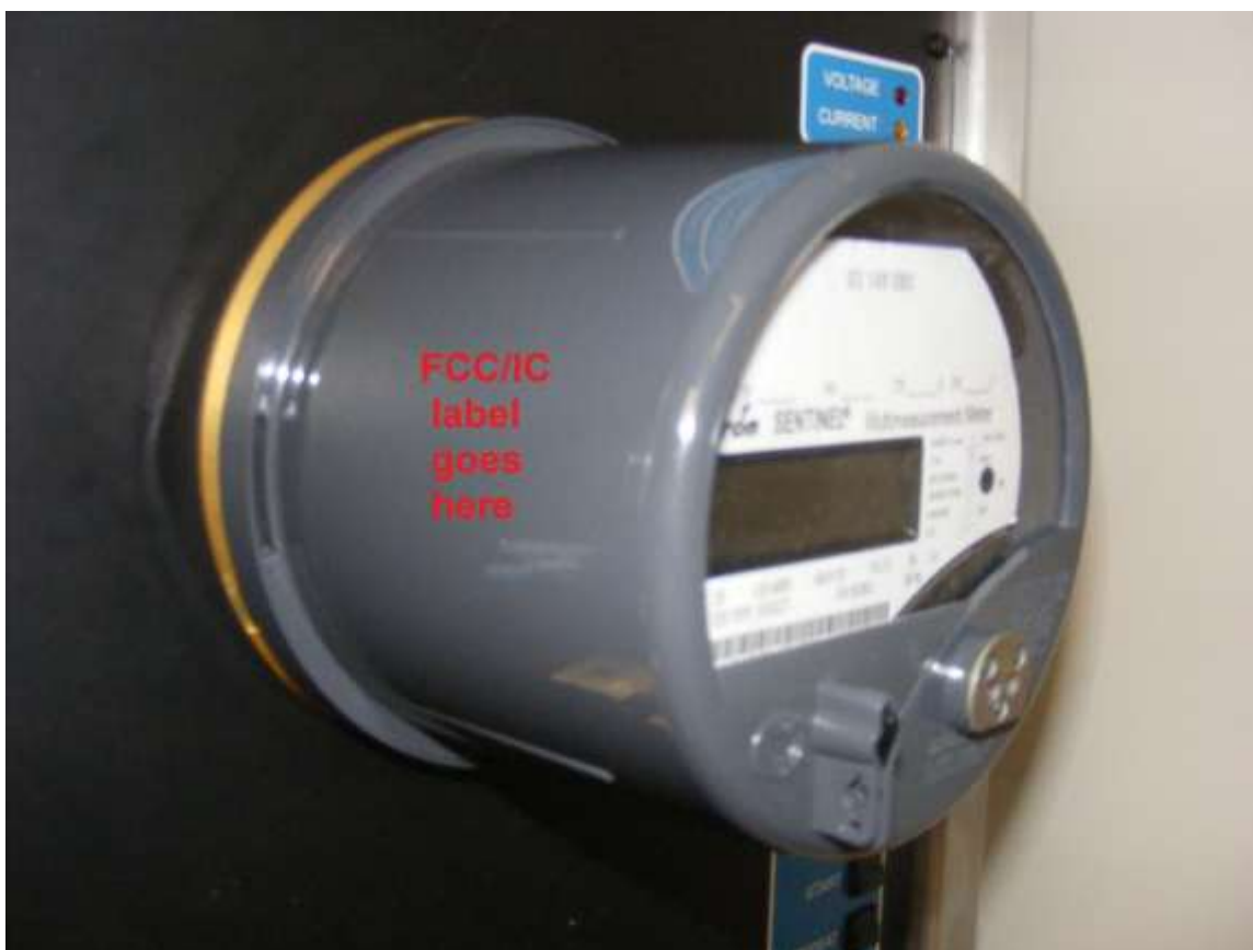
Figure 2: External Label Location